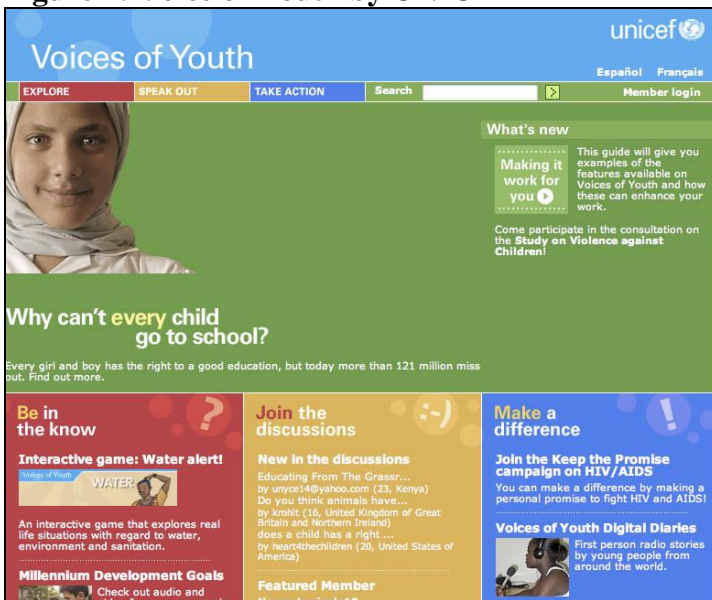
Figure 2: Voice of Youth by UNICEF

The second example is the Voice of Youth discussion forum maintained by the United Nation’s Fund for Children (UNICEF). Voice of Youth was launched in 1995 as a way for more than 3,000 young people from 81 countries to send messages to world leaders at the World Summit for Social Development. The website and the online discussion boards were created in 1997 for young people to interact with one another over the Internet. In addition to the discussion forum, the website also features an area where people can find out more in-depth information about various issues concerning child rights and development and also an area where people can take different action, online or offline, in their respective communities.