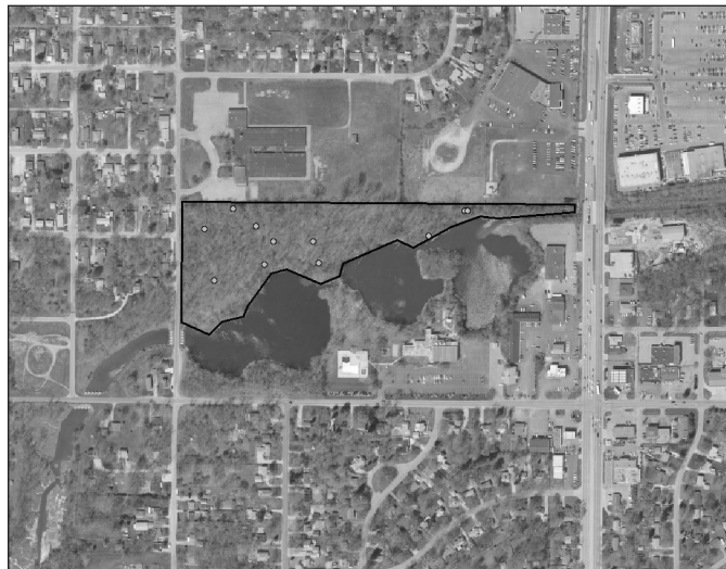
Figure 1. Aerial photo (2004) of one of the 20 suburban/urban woodlots in Marion County, IN surveyed for this study. The woodlot is bounded by a polygon and the leaf nests by circles therein. Photo scale 1: 3500.

Many of the woodlots surveyed were surrounded, in part, by a variety of different habitats known to be suitable for fox squirrels, such as park woods and wooded residential areas. Likewise, a number of the woodlots were surrounded, in part, by habitats unsuitable for Eastern Fox Squirrels, such as major roads (4 or more traffic lanes) and highways and large commercial areas (buildings and parking lots; Fig. 1). Although I did not characterize vegetative characteristics in detail for this study, the woodlots resembled disturbed woodlots characterized in a previous study (Salsbury et al. 2004) conducted in the same area. The woodlots in this study consisted of disturbed secondary growth stands comprised of deciduous trees, most notably Quercus rubra L. (Northern Red Oak), Q. alba L. (White Oak), Acer saccharum Marshall (Sugar Maple), A. rubrum L. (Red Maple), Fraxinus spp. (ash), Ulmus spp. (elm), Carya spp. (hickory), and Celtis occidentalis L. (Hackberry). Levels of disturbance within the woodlots varied from the presence of human footpaths to piles of trash and yard waste to felled trees. The density and composition of the understory and herbaceous layer also varied among the woodlots. The understory, when present, generally consisted of