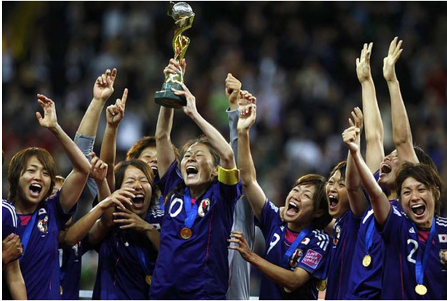
Figure 2. The Nadeshiko Japan team celebrates winning the 2011 World Cup in Germany.

interested in pursuing hobbies and other nonpaying past times. The only problem is that in Japan's current labor economy nonregular employment in one's youth quite frequently leads to nonregular employment for the rest of one's life.