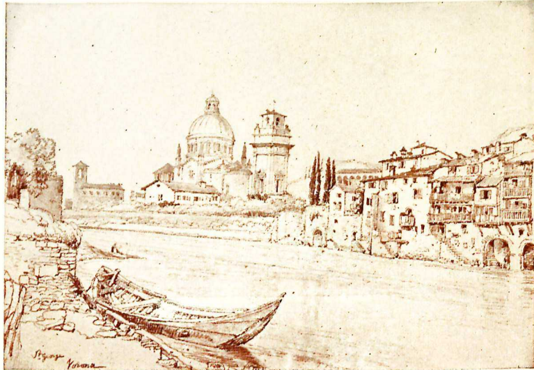
VERONA, ST. GEORGE'S CHURCH