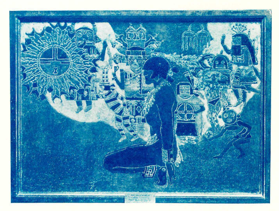
THE HOPI WORLD