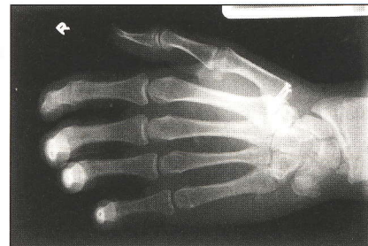
Figure 3: With the advent of mini-screws and –plates, some surgeons with the necessary technical training fix these small fragments in an anatomical and stable position. This has the advantage of early mobilization without the use of any splints.