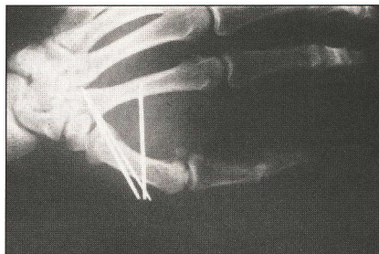
Figure 2: Reduction and stability can only be achieved by closed reduction and percutaneous fixation (protected by a plaster cast) for six weeks.