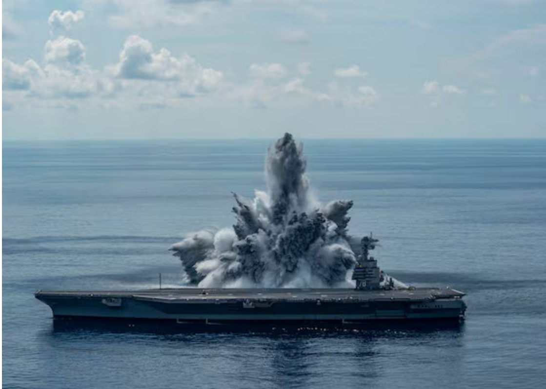
Figure 1. CVN 78 FSST.