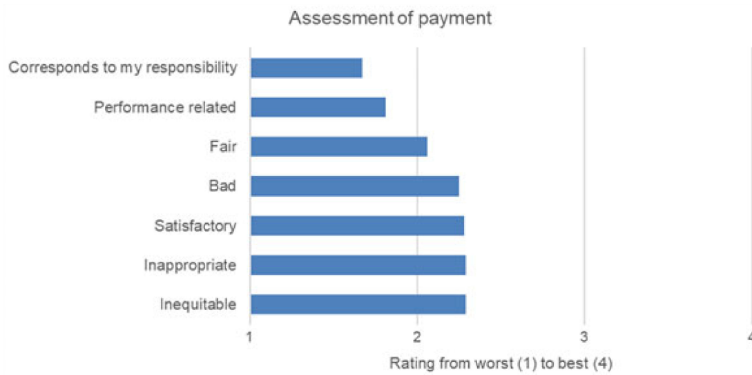
Figure 2. Detailed answers for the subscale “Payment”.