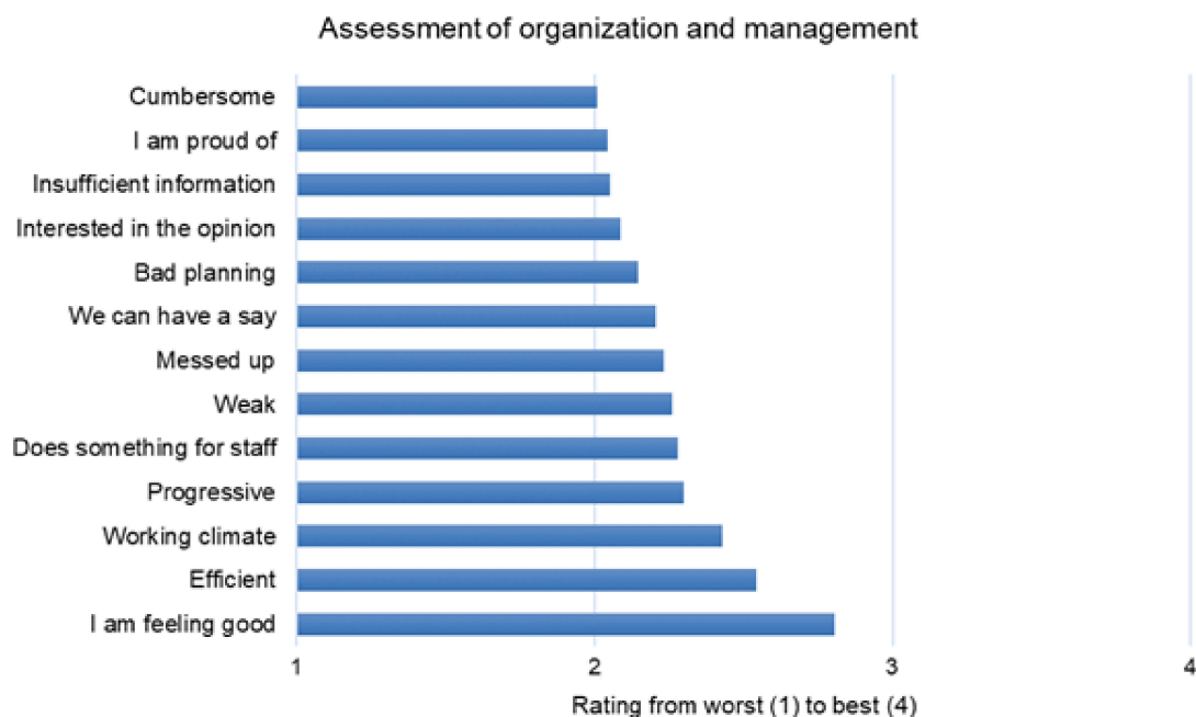
Figure 1. Detailed answers for the subscale “Organization and Management”.

* the difference is negative when satisfaction is worse in paramedics.