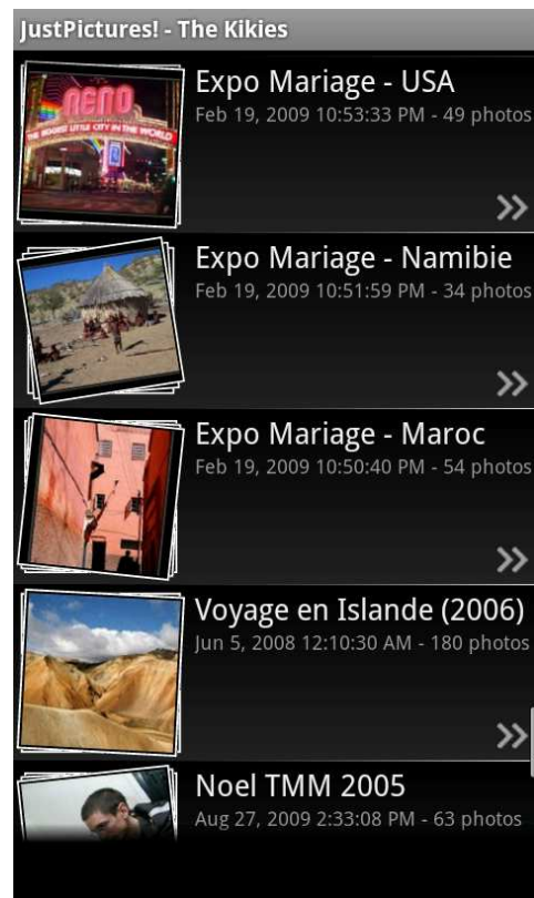
Figure 2: JustPictures in album view

Within this section, we only describe some of the existing applications that deal with the administration of image collections on mobile devices. Mor Naaman et al. give a more detailed overview in [Naaman et al. , 2008].