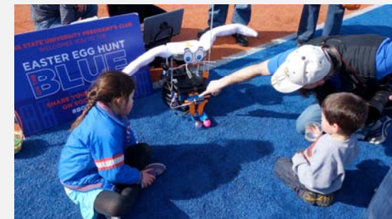
Turtlebot on The Blue Turf with some future Broncos, after the team participated in the Easter egg hunt.

Once all the elements of the robot were assembled, and the code was properly configured, the Turtlebot was able to detect eggs in the signal processing lab where most of the robot was designed and assembled. It participated in the 4 th annual Easter Egg Hunt on the Blue.