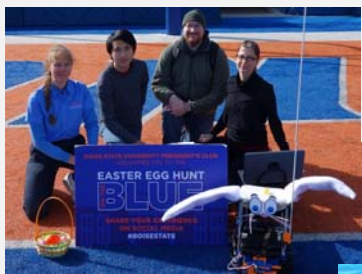
Boise State's Turtlebot team

The Turtlebot robot platform was customized to identify and retrieve an Easter egg on the famous blue turf, at Boise State University.