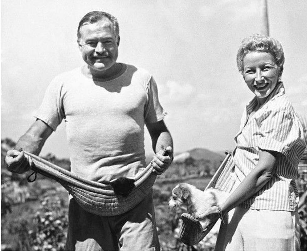
Ernest and Mary Hemingway at Finca Vigía holding a kitten and puppy in jai alai wickers