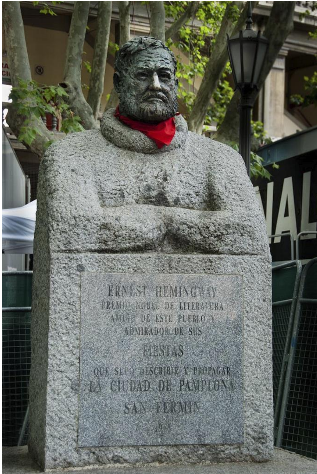
Hemingway statue in Pamplona