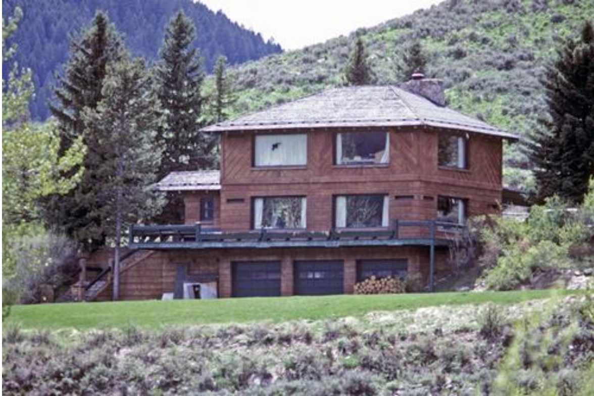
Hemingway house in Ketchum, Idaho