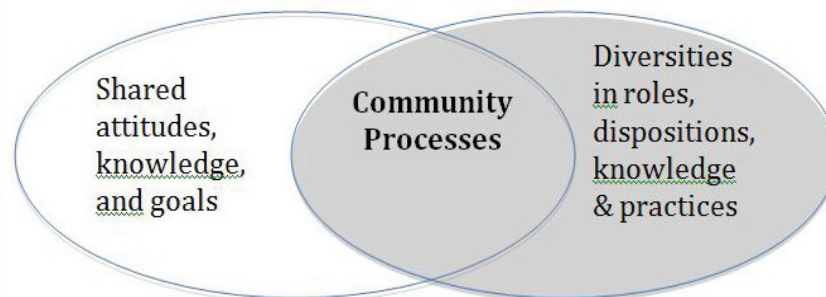
Figure 1 Intersections of Shared Understandings and Diversities

Data analyses demonstrated shared attitudes among participants in the EELG. Liaisons agreed that K-8 students were the “bottom line” of shared work in terms of candidate preparation and its focus on elementary student learning and growth. The EELG emphasized a co-teaching model (Bacharach, n.d.; St. Cloud University, 2011) for candidates and mentor teachers. Unity around this model allowed all to take collective responsibility for candidates and elementary students. Liaison work expanded beyond a solely university or school context; all of the people involved highlighted human capital around a shared understanding of elementary student growth. This belief in clinical practice and the importance of partnering with schools, along with an appreciation for differences among our approaches,