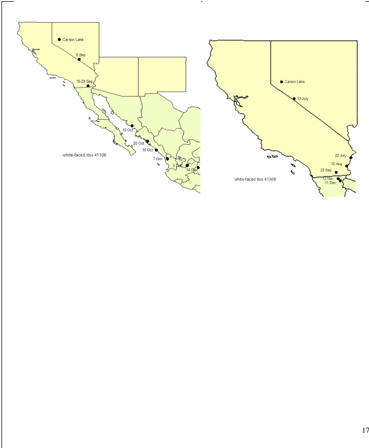
Fig.3. Available information on southward migration of the four white-faced ibis with high concentrations of DDE in blood plasma