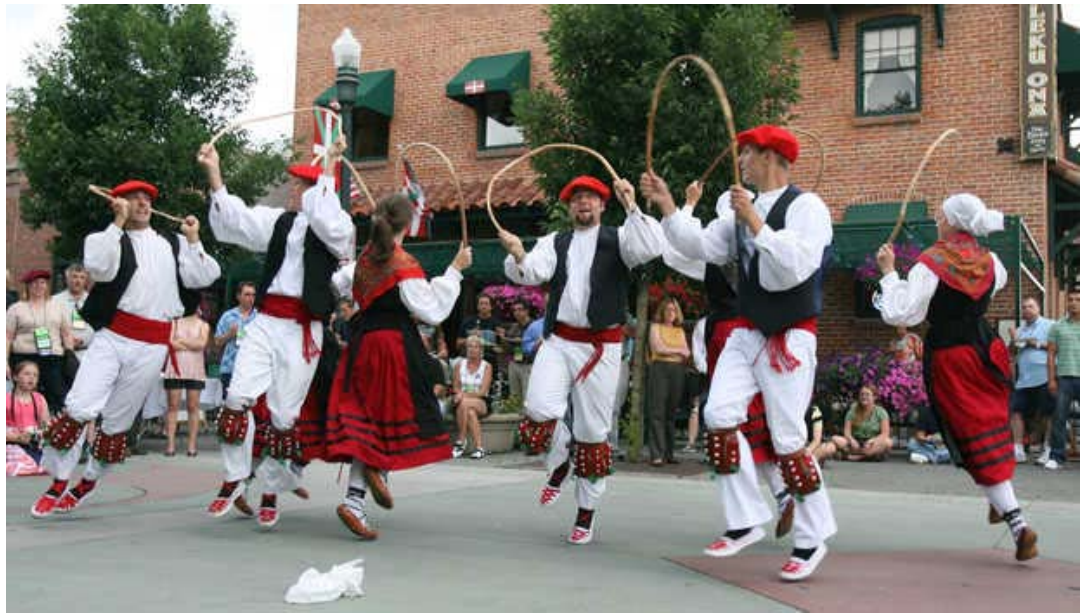
Figures 4: Jaialdi, the international Basque Festival held in Boise, Idaho

Branding Basq Bilbao, and Bo Marketin Metaphor for Hist