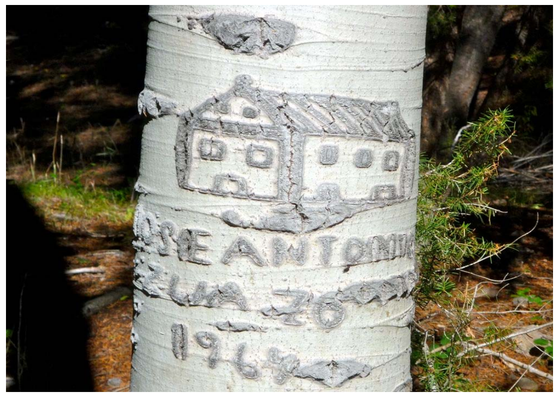
Figure 6: Basque Arborglyphs from Idaho Mountains

The Basque Center, built almost 40 years earlier, still serves as a gathering place for Basques for most social events. The Basque Center hosts the Sheepherders' Balls, the Basque Bazaar, countless Basque wedding receptions and monthly Euzkaldunak dinners. Next door to the Basque Center stands the Basque Museum & Cultural Center. In the mid-1980s, the museum's founder acquired the red-brick house, built in 1864 and operated for decades as a Basque boarding house, as a spot to preserve information about Basques' immigration to Idaho. In 1987, officials dedicated the building, and planted an oak sapling from the Tree of Gernika in the Basque Country. [3] The Museum also acquired the building next door, which was remodeled to include a gift shop, an exhibition room, a library and classrooms. Older Basques volunteered to assist visitors in the main exhibition, which featured photographs of early immigrants and an actual sheep wagon as part of a display of the herding life. Countless tourists along with schoolchildren from around the state are offered presentations on Basque history and culture. Basque language courses for adults also continue to be taught.