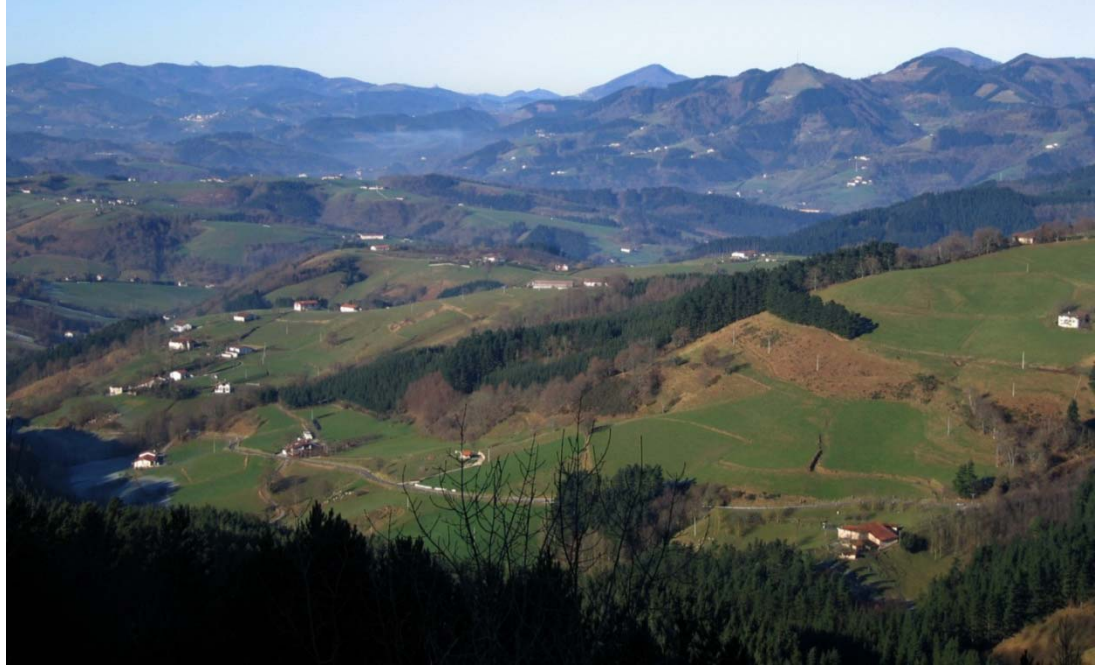
Figure 1: Baserriak (Basque Farmhouses)

In the vista that surrounds the Guggenheim Museum in Bilbao one sees three of the major eras in Basque history: the farmhouses that dot the hillside, the cranes along the Nervion River that harken back to the heyday of industrial shipping and the modern revitalized urban core that accommodates tourists and visitors to the Museum. For centuries, the "baserriak," Basque chalet-like farmhouses, formed the heart of the rural Basque identity and in many cases provided the names for individual Basque families (See Figure 1).