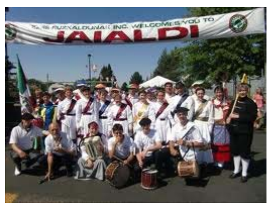
Figure 3: Jaialdi, the international Basque Festival held in Boise, Idaho