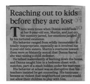
Figure 4. Sample documents. From top to bottom, left to right: XVII-a, XVII-b, XVIII-a, XVIII-b, XX-a, XX-b.

bras de la Compagnie : Il é Oncle, Frère de fa Mère, pour motif de la fuite le de de retirer son Père du triffe e