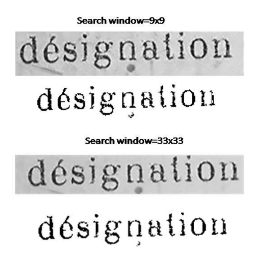
Figure 1. Influence of the size of search window parameter in NLmeans. Filtered and binarized sample word. Large windows regularize more but degrade fading character parts.

Instead, the similar sub images for pixel are searched for in a region around the considered pixel. Let us assume that this search window is a square whose side is 2K + 1. The size of this search window affects the pixels that could be found and the level of regularization on the image. A larger searching window possibly allows more similar patches to be found and thus yield a filter that better preserve the features. However, this tends to produce more regularized images since the restored pixel will be a weighted average of more values. This behavior gives a background that is more homogeneous. This also produces a small loss of contrast. Let us emphasize that this loss is much less strong than for Total Variation based filter (see Section 2.2). Nevertheless, there will be less contrast between background and characters due to the averaging with more data patches. As a consequence, the fading characters lose more pixels after binarization. Figure 1 shows the effect of the size-of-search-window parameter. A sample word has been preprocessed and binarized using the document threshold (see Section 3).