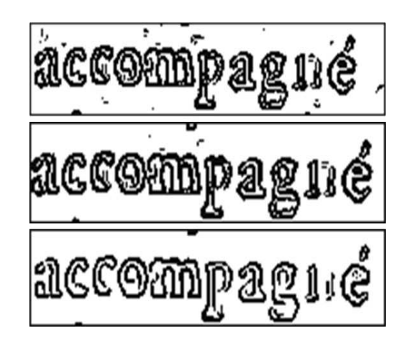
Figure 3. Edges from a highly degraded word from set XVIII-b. From top to bottom: without pre-processing, after restoration by NLmeans, after restoration by TV.

The restored image \hat{u} is the minimizer of the energy E(u|v) that is a weighted combination of the two above