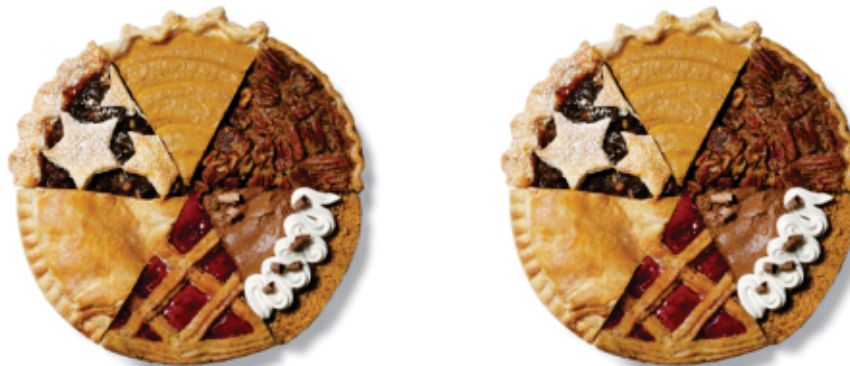
Figure 1 © Brian Fitzgerald

Does 1 pie + 1 pie = 2 pies or 12 slices. Depending on how you see the world 1+1 can equal 12. You could have 2 people argue about the answer of 1+1, but the truth of the matter is that they would both be right--when discussing the pies, 1+1 can equal 2 pies, or 12 slices. When we take time to gather information and understand another person's point of view, you may find that you are both saying the same thing. Even if you aren't saying the same thing, if you understand how they see their pie, as a whole or as parts, or even how many parts they see, communication becomes much clearer.