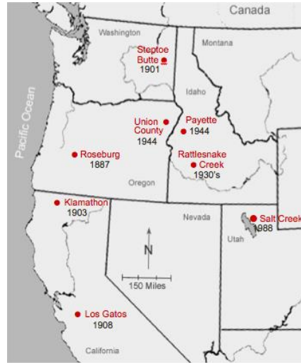
Figure 1: Introduction history of Taeniatherum caput-medusae .

Taeniatherum caput-medusae (Poaceae) is a highly selfing, Eurasian annual grass that is invasive in the western U.S. This invasion is well documented, and the first instance was recorded in 1887 (Figure 1).