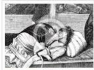
Opium: For Pleasure and for Pain