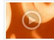
Bilharzia: Kill or Cure, Series 1