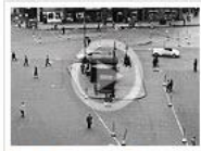
Rudy Burckhardt Compilation: Man in the Woods an ...