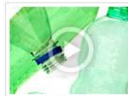
Practical Use of Materials: Dietetics