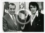
Opium: The War on Drugs