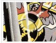
Roy Lichtenstein: Reflections