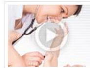
Human Services Careers