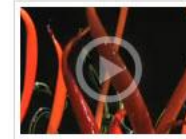
Chihuly: Fire and Light