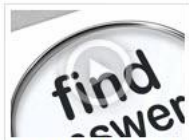
ICT in the Real World: A Case Study in Problem