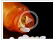
Opium: Traders and Traffickers