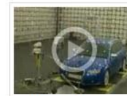
Empire of Sounds