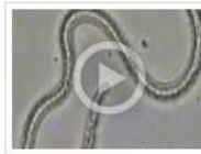
Lymphatic Filariasis: Kill or Cure, Series 1