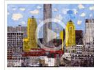
Dad's in Heaven with Nixon