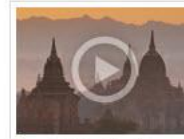
Give Me the Short Version on Burma