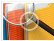
ICT in the Real World: Skills for the Workplace