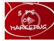
Promoting Your Designs