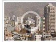
Welcome to Tehran: Ragueh Omaar Inside Iran