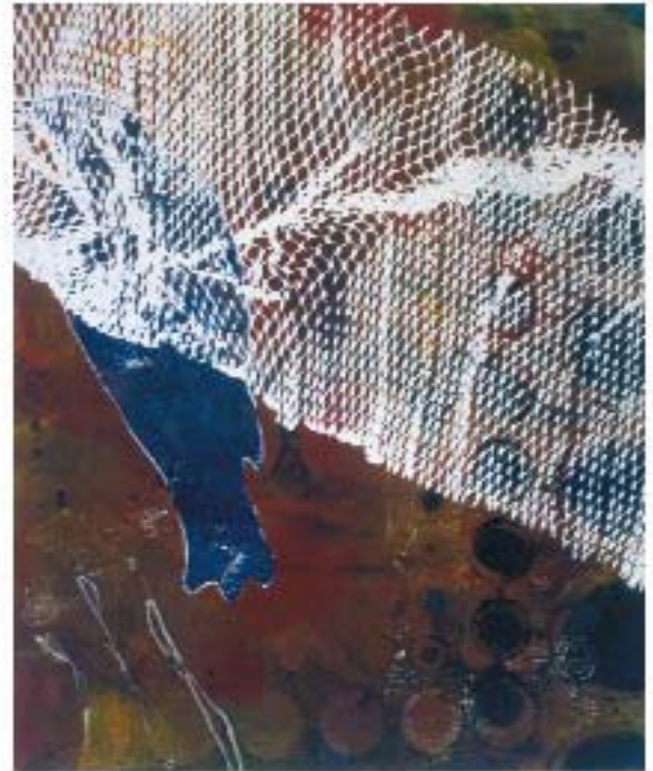
Figure 3 Arbitrary Predicament x " monotype

Often, I situate readily identifiable characters from the stories in suggestive arrangements, frequently with contrasting design elements. In figures 1-5, all of the creatures rest in reticent gestures, yet there are more complex distinctions provoking the viewer's assumptions.