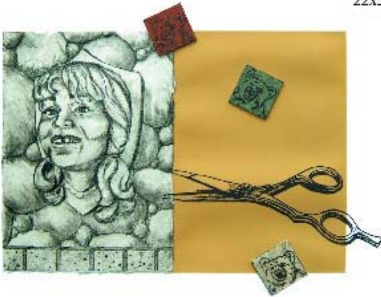
Figure 12 Goldilocks and the Three Bears 22x30" drypoint, serigraph, collagraph

The objects and the suggestive placement of the repetition of each of the three animals implies their violent actions. Each of the chosen colors in the pieces is symbolic for key elements in the story: green for the grass that the Billy Goats kill the troll for; gold for the intruder Goldilocks' hair; and red for fire and the indestructible red brick house.