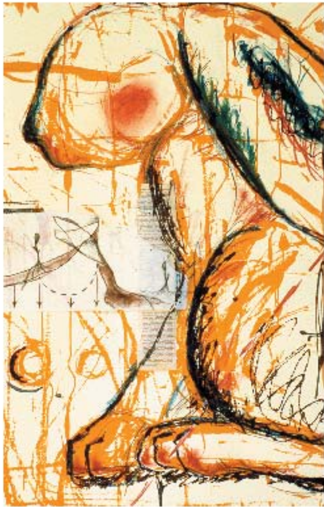
Figure 2 Pensive Lullaby 22x30" serigraph, drypoint, collage

Often, I situate readily identifiable characters from the stories in suggestive arrangements, frequently with contrasting design elements. In figures 1-5, all of the creatures rest in reticent gestures, yet there are more complex distinctions provoking the viewer's assumptions.