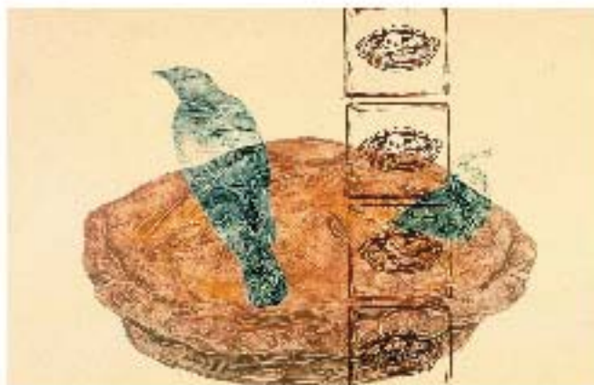
Figure 1 Kindred Exposed 11x15" collagraph, relief

Opie, Iona and Peter. The Classic Fairy Tales . London: Oxford University Press, 1974.