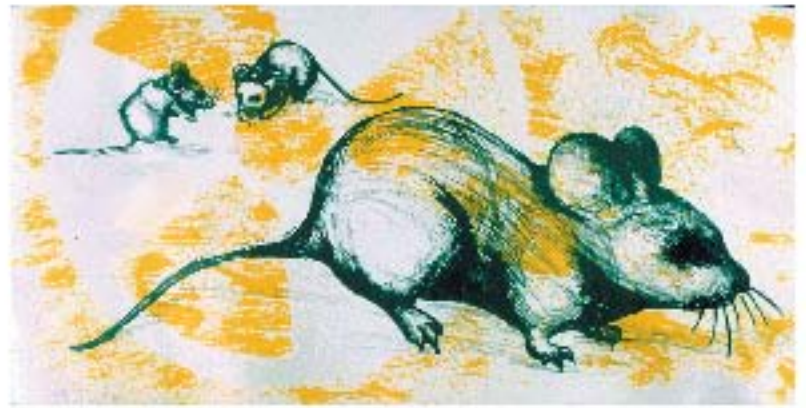
Figure 5 We Blind Mice 10x20" Waterless Lithography

This next series investigates rhymes and stories involving sheep, which have potent connotations in our culture. Fig.'s 6-8 particularly plays with the song, "Mary had a little lamb," yet the Mary is missing, and the viewer is subjected to feelings of isolation and abandonment, as the lost lamb contemplates its guideless actions.