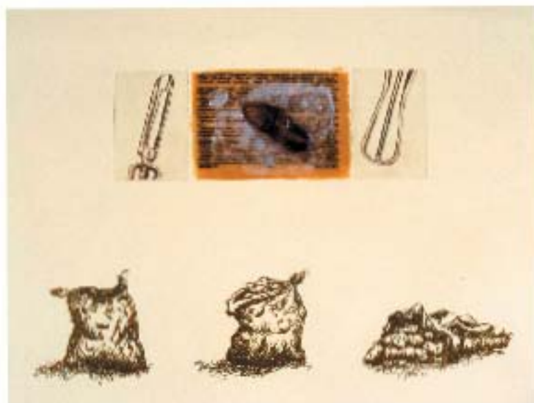
Figure 10 Three Bags Fall... 10.5x13.5" etching, serigraph, chine colle, wax, potato peel