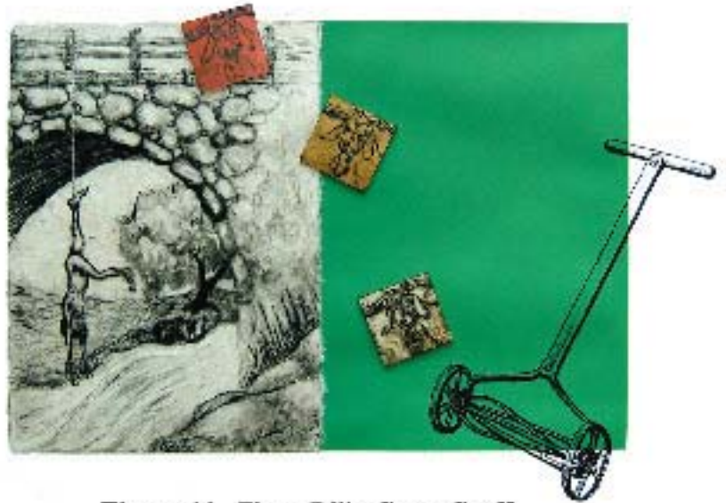
Figure 11 Three Billy Goats Gruff 22x30" drypoint, serigraph, collagraph

In this particular series, I examined three different stories, each with a hierarchy of three similar characters and a contrasting antagonist. The contrasting dual positions of the literal, monochromatic, single-frame narratives next to simple blocks of color and suggestive objects dramatize the violence and begin deconstructing the saccharine surface of the stories.