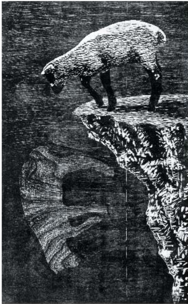
Figure 6 Where Has Mary Gone? 15x25" Woodcut