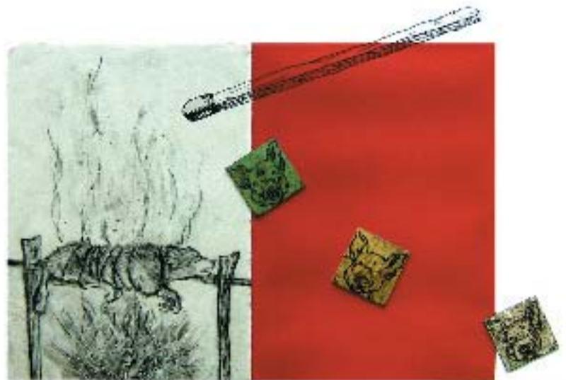
Figure 13 Three Little Pigs 22x30" drypoint, serigraph, collagraph

In each of the stories, it is interesting that there are three main characters, hierarchically staged by some type of class, strength or intelligence, and their foe meets a brutal ending due to someone's selfish consumption. Juxtaposed as a series, the color combinations resemble those of a traffic signal, reinforcing the hierarchies.