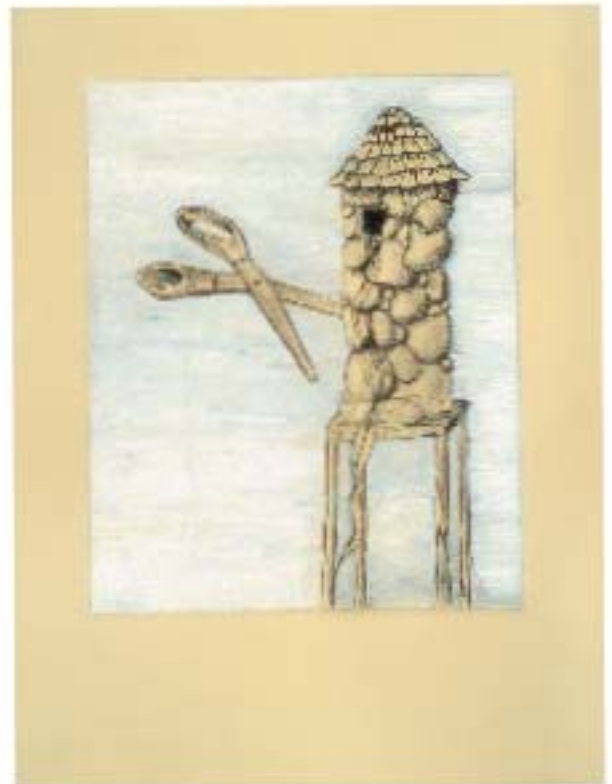
Figure 9 Let Your Hair Down 11x15" drypoint monotype

"Baa Baa Black Sheep" is the story referred to in Fig. 10, but the wool has been replaced by potatoes, giving a contemporary connotation referring to the exploitation of small American farmers being overrun by wealthy mass production farms, large corporations and urban expansion. The fragmented potato peeler framing text and a potato peel preserved in wax symbolizes the prideless position these independent farmers are forced into.