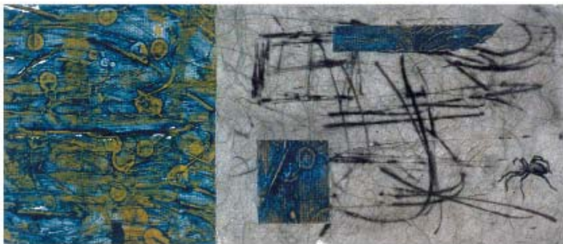
Figure 4 Itsy Bitsy Barriers 15x22" drypoint, collagraph, collage