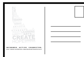
FLYER/POSTCARD FRONT & BACK