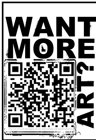
11 x 17 POSTER

—Advocacy White Papers For Art Education Jerome Hausman