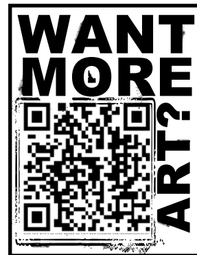
8.5 x 11 POSTER