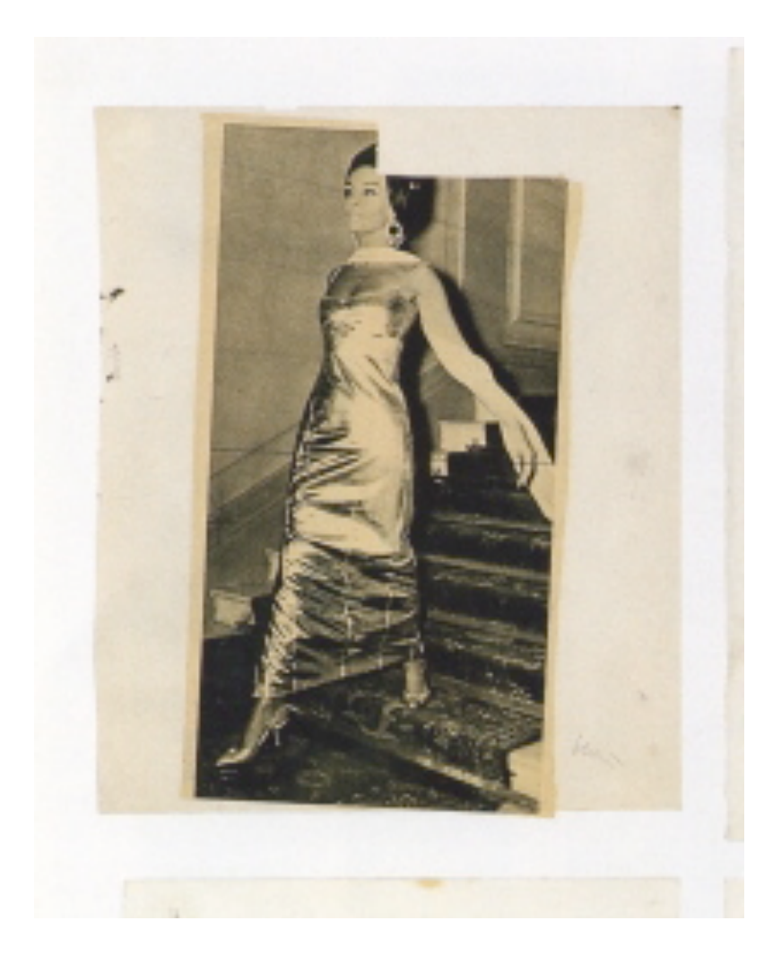
Plate 2: Gerhard Richter, Atlas , 1964, (Panel 13, detail), newspaper clipping