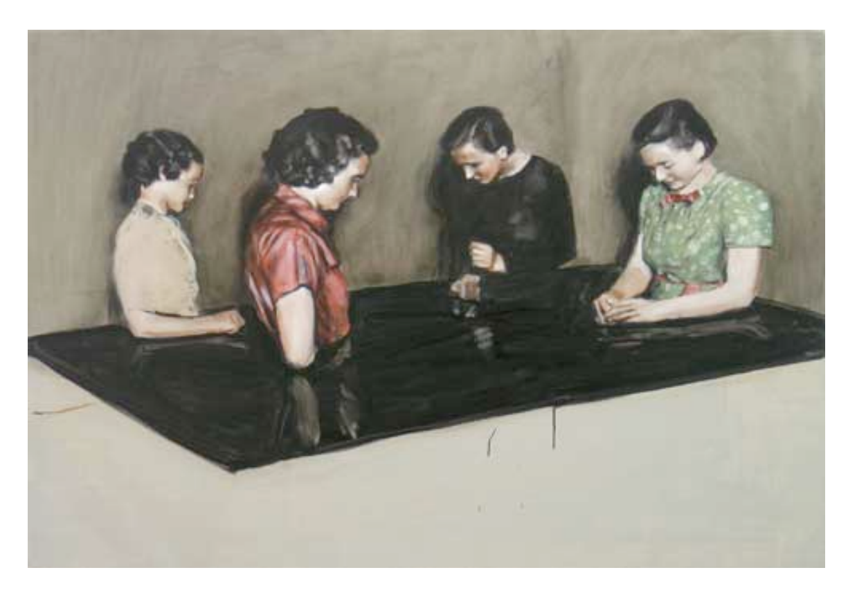
Plate 3: Michaël Borremans, Four Fairies, 2003, Oil on Canvas, 110x150 cm