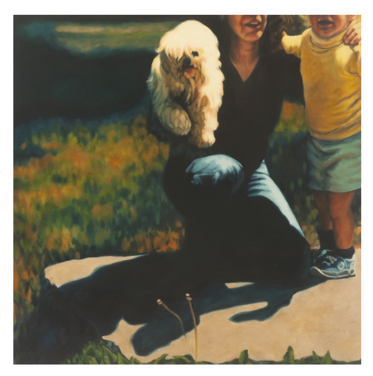
Plate 9: Canis Minor, 2011, Oil on Panel, 4'x4'