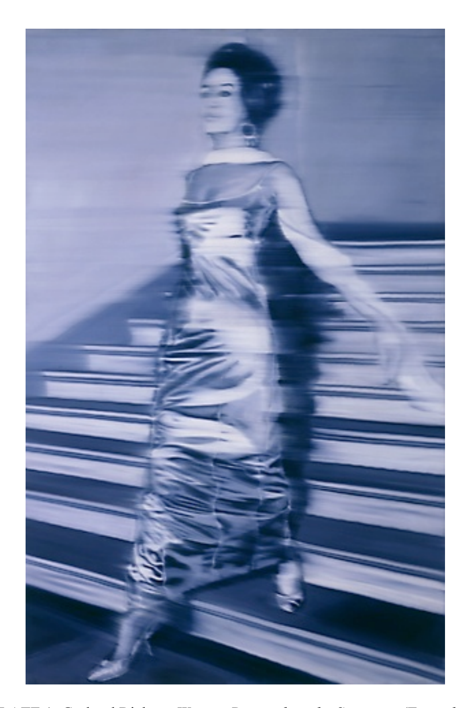
PLATE 1: Gerhard Richter, Woman Descending the Staircase (Frau, die Treppe Herabghend), 1965, Oil on Canvas, 198x128 cm