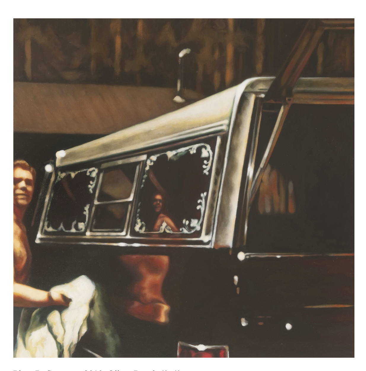
Plate 7: Compass, 2010, Oil on Panel, 4'x4'