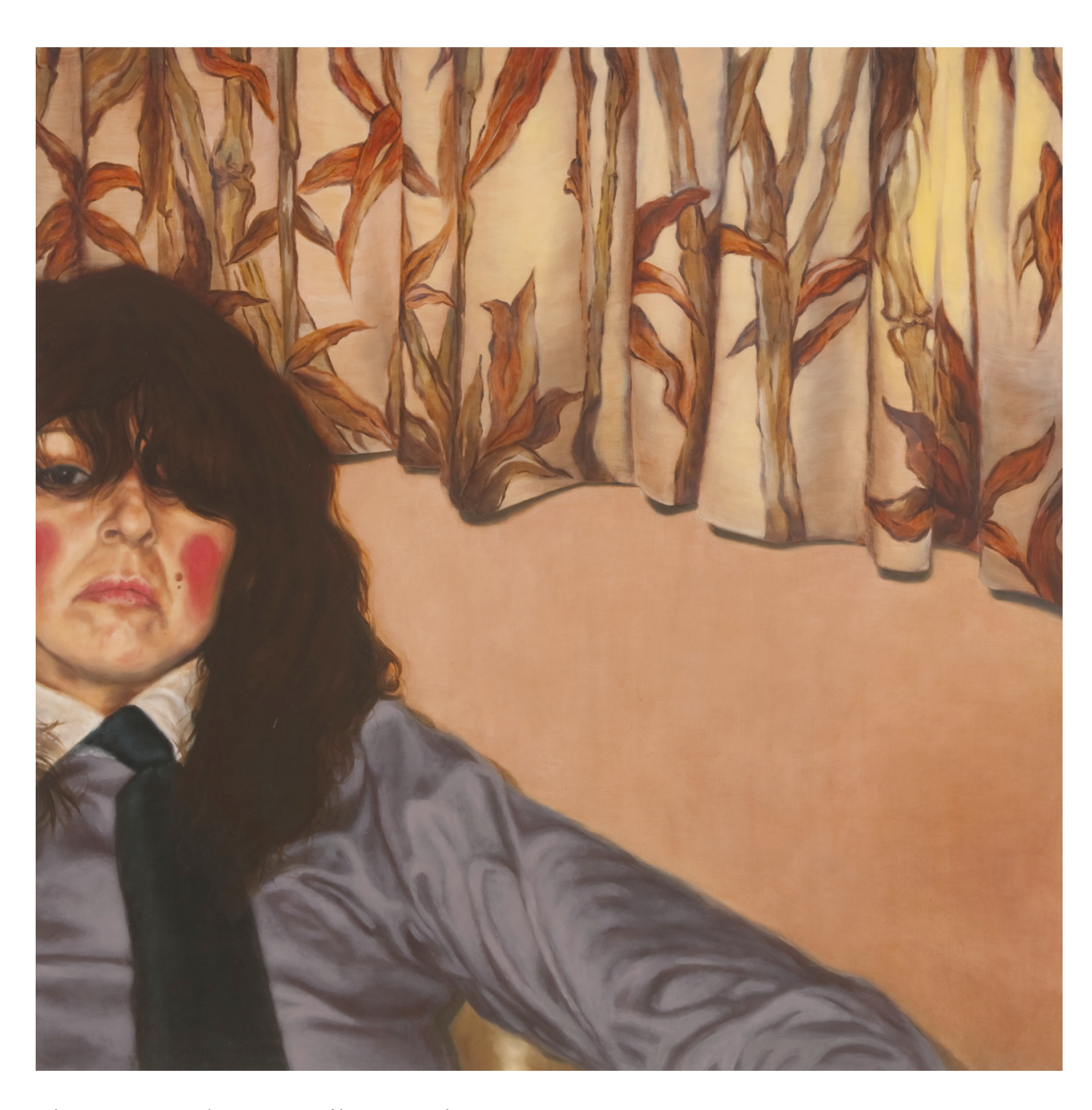
Plate 10: Oracle, 2011, Oil on Panel, 4'x4'