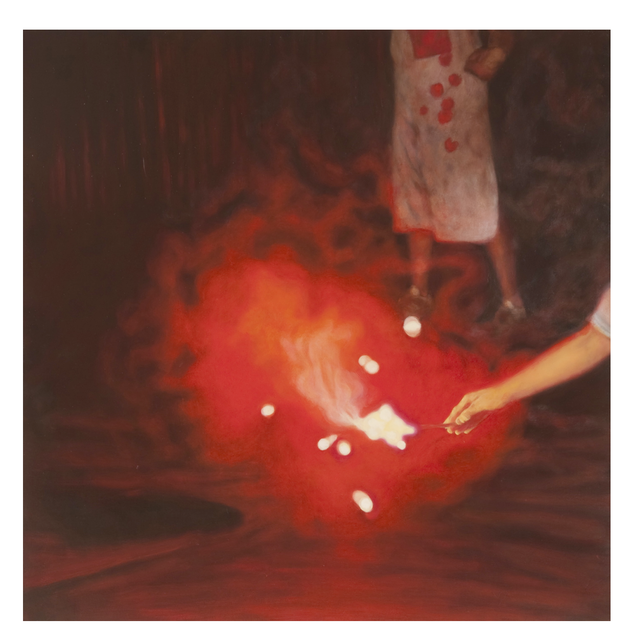
PLATE 6: Constellation, 2010, Oil on panel, 4'x4'