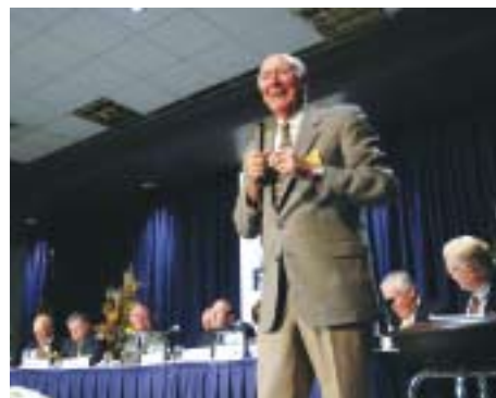
Governor Cecil D. Andrus welcomes the conferees.

We are far from consensus, politically or legally, about many of the domestic policy issues that arise from the threats presented by terrorism.