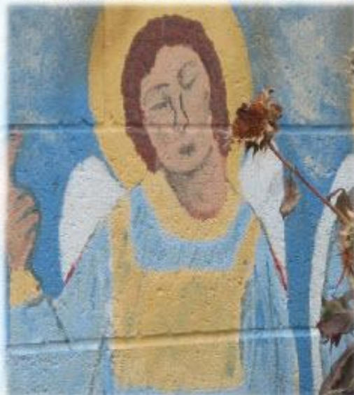
Mixed on the courtyard wall. "Angel smiling sunflower"