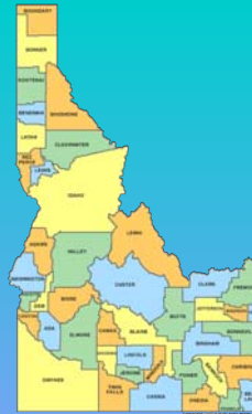
Figure 1 – Idaho Counties

This poster examines historical crop production in the South Central region of Idaho between 1938 and 2009. The South Central region is comprised of eight counties; Blaine, Camas, Cassia, Gooding, Jerome, Lincoln, Minidoka and Twin Falls (Figure 1). Historical acres harvested were examined for nine major crops; alfalfa hay (dry), barley, corn (grain), corn (silage), oats, potatoes, spring wheat, sugarbeets and winter wheat. Although other crops are grown in the area, the nine crops examined account for the greatest percentage of harvested acres within the region. Acres harvested were obtained from data available from the National Agricultural Statistics Service (NASS) www.nass.gov .