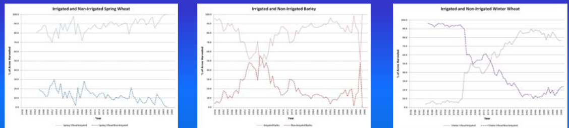
Figure 4. Percent of total harvested acres irrigated and non-irrigated

Figure 2 shows the total harvest acres of the nine major crops (by acres harvested) in the south central region of Idaho. Barley, winter wheat and spring wheat account for the largest harvested acreage within the South Central Region of Idaho until 1998 when the data suggest that harvested acres of alfalfa became the dominant crop by area. It is unclear from the data whether alfalfa was grown in the area prior to 1988 without making additional enquiries to NASS. The data available suggested that acres of winter wheat, spring wheat and barley started to decline in the late 1980's as production of oats and alfalfa hay increased. Spring Wheat production increased between 1942 and 1952, declined during 1952-1968, rose again for more than a decade and eventually declining and settling at 49,500 in 2009. Barley production rose consistently until 1982, reached its peak level and eventually came down settling at 133,000 acres in 2009. Winter Wheat production increased between until 1942 and 1952, experienced intermittent positive growth till 1996 and eventually decreased to approximately 86,600 acres in 2009.