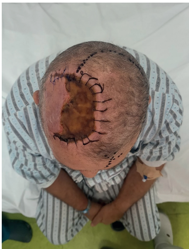
Figure 1. Fronto-parietal skin necrosis after tumor excision

Two weeks after the first signs of vascular insufficiency were noted, in the context of parietal skin necrosis with dimensions of 15/10 cm involving the flap used in the neurosurgical intervention, the excision of the necrotic area was performed, followed by reconstruction with a local rotated scalp flap, for coverage of the defect remained after excision (Fig. 2). Moreover, the flap dissection was performed in a periosteal plane in order to obtain as much mobility as possible and to ensure a good vascular bed for the split thickness skin graft.