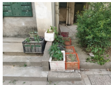
Figure. 25. The scenario in Sanlin Community of informally claiming public space everywhere.

However, any reclamation of public space requires formal approval, so any spaces without authorisation, technically, should be considered illegal. Many Case C operators have regarded the structures, planters, and the claimed space as their private property, which their neighbours can enjoy, and observe, but cannot alter. Also, while the design and arrangement of the area may satisfy the operators, it may not be in accordance with the desires or aesthetic values of other neighbours. Therefore, concerns have been expressed specifically about the privatisation situation by some other residents, who believe that improving the neighbourhood environment should rely on comprehensive plans rather than piecemeal build-by-people experiments, which may change the neighbourhood into a fragmented set of circumstances. Consequently, this scenario may present challenges for the formal management of the neighbourhood, regulations may necessitate defining and justifying which areas are legally permitted for build-by-people trials and what are the criteria for the practises.