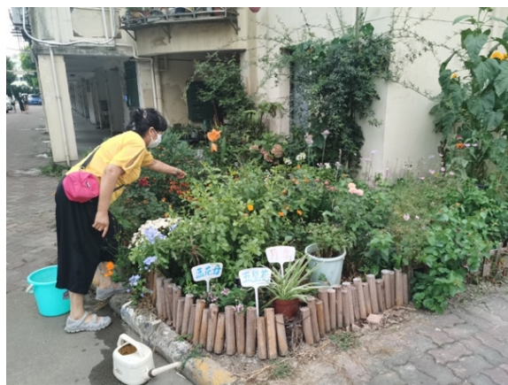
Figure 5. (Left) A resident was managing the garden at the front of his flat. Source: author, July 2022. Figure 6. (Right) DM01 was stewarding the Fazhi Garden in Case A. Source: author, July 2022.

The second type of build-by-people trials in this study, referred to as DIY tactics, involves ordinary individuals continually and autonomously developing and stewarding private, semi-private, or semi-public spaces. Thousands of people have signed up for the Seeding Plan, with active participants in Beijing, Shanghai, Tianjin, Guangzhou, and other Chinese cities. Among thousands of seeding gardens in Shanghai (CNS, 2023), Sanfendi Garden in Tongji Village has been selected as the study field (Case B) (fig. 7). Sanfendi has made a significant impact among Shanghai's numerous practices since SP01's proactive efforts have opened up her private, or technically speaking, the ambiguous semi-private space, into a community common space. In addition, she has not only shaped and reshaped the garden but also worked with neighbours to steward additional public spaces in the neighbourhood without the ongoing assistance of trained professionals (fig. 8).