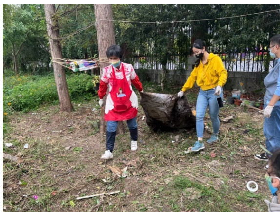
Figure 7. (Left) Sanfendi, Case B. Figure 8. (Left) SP01 and her neighbours were cleaning up rubbish in the neighbourhood's other public spaces.

Simultaneously, some other individuals who were not engaged in the community participatory programme in Sanlin Community and the Seeding Plan in Tongji Village were motivated to take action on their own. Those spaces are technically owned and operated by authorities, but they were claimed and shaped spontaneously and informally by surrounding neighbours, resulting in the third type, the informal trials. Such reshaped spaces in both Sanlin Community (Case C) and Tongji Village (Case D) are manifested in forms of farmland (fig. 9), collected planter boxes (fig. 10), front garden (fig. 11), or decorated by other structures (fig. 12).