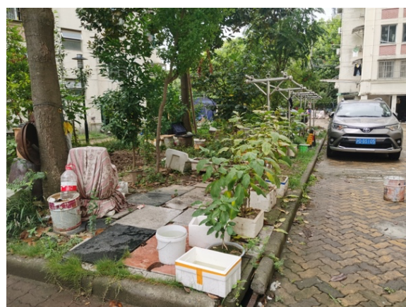
Figure. 18. (Left) A typical public space between buildings in Sanlin Community. Source: author, September 2022. Figure. 19. (Right) The maintained public space in Case C. Source: author, September 2022.

Rather than waiting for a formal solution to impose changes, build-by-people experiments in studied cases have proved their values to contribute to what authorities have been unable to govern or manage. While not conventionally considered residents' responsibility, these trials help activate forgotten spaces and transform those spaces into visible, accessible, and interactable public spaces. The shifting roles of residents ultimately help strengthen a more publicness milieu of community public spaces, when those spaces were temporarily forgotten by authorities.