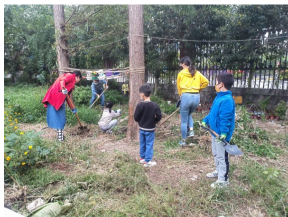
Figure 14. (Left) Neighbours were visiting Sanfendi in Case B during the city lockdown. Figure 15. (Right) Residents worked together to clean trash in the neighbourhood's other public spaces in Case D.