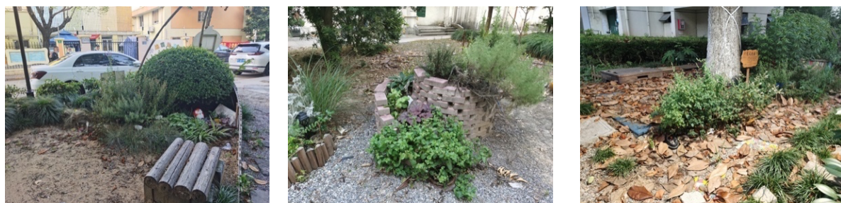
Figure 4. Developed gardens have been forgotten.

To test individuals' capacities and public awareness in making contributions to take action and contribute to improving their surrounding areas, some action plans were coming to the fore. A prominent example is the Seeding Plan, which was launched in early 2020 during the pandemic by the Clover Nature School (CNS), a non-profit organisation which specialises in leveraging community gardens as a strategy to regenerate community public space. 'Rebuilding trust, planting hope' has been shared as the advocacy of the programme, with the objective of not only greening their balconies and other semi-private spaces, but also rebuilding social connections (Kehrer, 2020). It is a special action against the covid-19 epidemic, which aims to decentralise the community garden to spot-on building rooftops and balconies, while at the same time, transferring love and trust by sharing seeds or plants (Liu, 2020). The potential sites for accommodating these mini gardens can be diverse. Private balconies, semi-private back or front yards, and semi-public community gardens or roof-top spaces are all can be the spots for initiating planting activities (Liu, 2020).