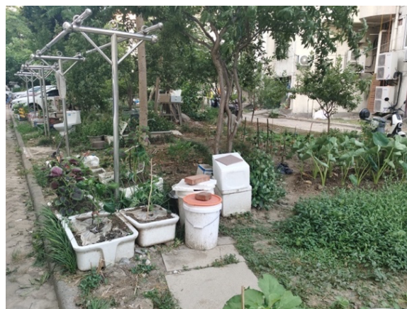
Figure 11. (Left) Transformation of decaying space into open front garden in Case D. Figure 12. (Right) Transformation of decaying space with decorations and temporary structures.