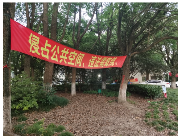
Figure. 24. ‘Illegally occupying public space will result in prohibition and removal’ banners in Sanlin Community. Source: author, July 2022.