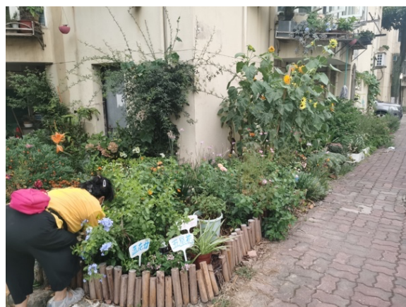
Figure. 16. (Left) A typical building corner space in Sanlin Community. Source: author, July 2022. Figure. 17. (Right) Fazheng Garden in Case A. Source: author, July 2022.