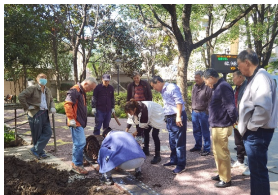
Figure. 1. (Left) Community Planner Workshop, group presentation. Source: author, August 2021. Figure. 2. (Right) College Student Community Garden Production Competition, local residents and young professionals were collaboratively working on the development of a community garden. Source: author, September 2021.