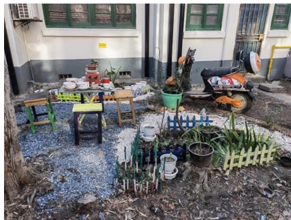
Figure 9. (Left) Transformation of public space between buildings into farmland in Case C by DM02. Source: author, July 2022. Figure 10. (Right) Public space between buildings has been claimed by planter boxes in Case C by DM03. Source: author, July 2022.