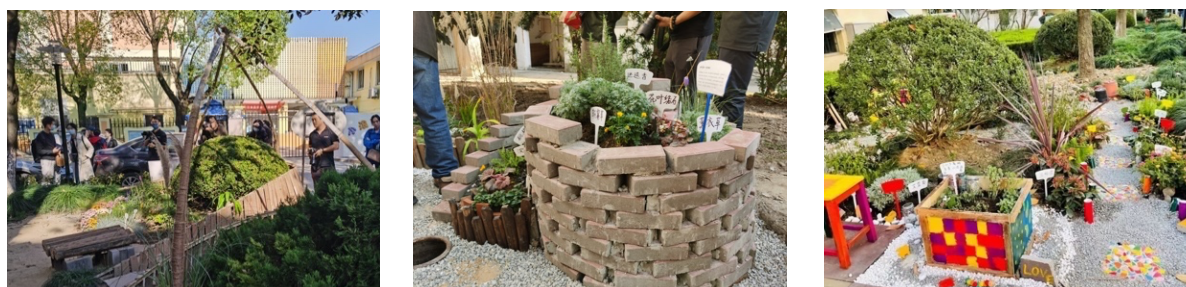
Figure 3. Community gardens developed through community participatory programmes.

Young professionals and local residents worked together to develop these community gardens (fig. 3), which were then turned over to the locals at the completion of the programmes. Whilst the majority of the shaped gardens have been abandoned by inhabitants following the city lockdown (fig. 4), certain gardens have been observed as being carefully maintained and continuously reshaped (fig. 5&6). Therefore, those public spaces which were initially directed by expert professionals, but eventually well-stewarded by individuals have been framed as the first type of the build-by-people trials, the stewarding practice. Fazhi Garden was chosen as Case A because DM01 has consistently assumed the responsibility of stewardship since this garden was developed as a product of the Community Planner Workshop in August 2021 (fig. 6). With the empowerment from the Community Planner Workshop, DM01 was able to make a proposal regarding the anticipation to improving this decaying building corder. Assisted by expert professionals and surrounding neighbours, Fazhi Garden was developed collaboratively, and DM01 proactively took stewardship by the end of the Workshop.