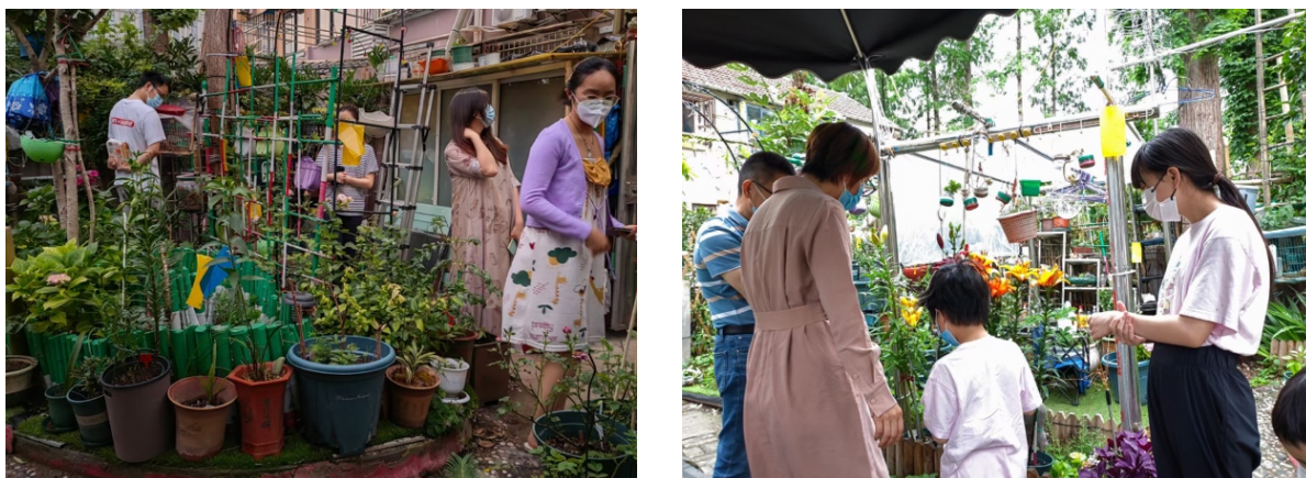
Figure. 20. Residents were visiting Sanfendi in Case A during the city lockdown.

While they were unable to save all of the trees in their neighbourhood (fig. 21), they were able to make a voice, protect a few (fig. 22), clean up debris, reshape spaces, and transform some into community common spaces (fig. 23).