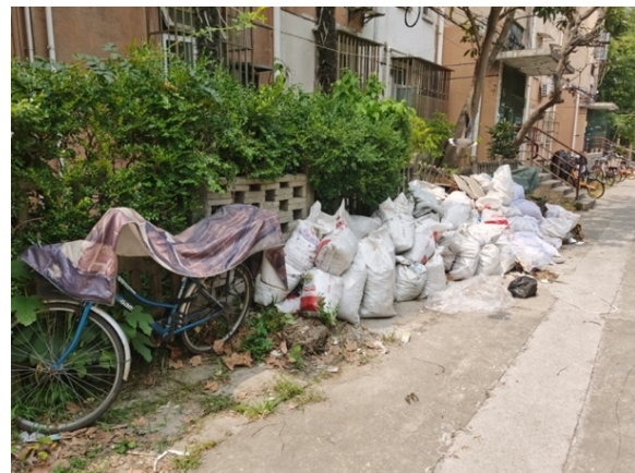
Figure 13. Views of Tongji Village.

Furthermore, SP01, who was living alone, noted how different from previously that in contemporary life, people even don't know their neighbours, which already upset her. The city's lockdown and quarantine also made social divides and barriers worse, further severing SP01's isolation from her neighbours. By agreeing on the 'Seeding Plan' philosophy, SP01 perceived a sense of obligation to contribute to the neighbourhood's maintenance and restore community social networks. Rather than believing, SP01 personally has a sort of desire and interest in planting, so participating in the 'Seeding Plan' can also be a way to fulfil her personal value and anticipation. A similar rationale can be found in all of the other cases, where people were inspired to act because they believed it was their responsibility to maintain order in their community and because they favoured planting as their personal interest.