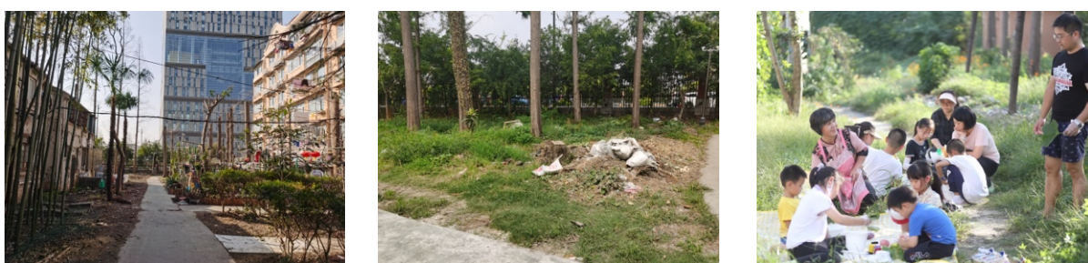
Figure. 22. (Left, Middle) A view of spaces around Sanfendi in Case A. Figure. 23. (Right) SP01 and families in the neighbourhood were decorating the area where trees had been taken down.