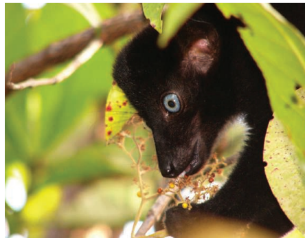
Male blue-eyed black lemur. Eulemur flavifrons in Sahamalaza–Iles Radama National Park.

An International Union for Conservation of Nature (IUCN) Species Survival Commission (SSC) Red List reassessment found that 94% of lemur species are threatened (2) (fig. S1 and table S1), up from 74% in 2008, which makes lemurs the most imperiled group of large vertebrates. Although other large mammals are also under pressure, for the vast majority of taxa in an entire infraorder (Lemuriformes) to be threatened is new, notable, and disturbing. This reevaluation has resulted from both the deterioration of habitat and the recent application of genetic data to phylogenetic analyses