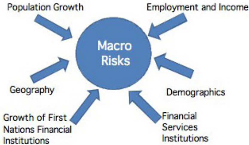
Figure 8.3: Macro Risks Facing First Nations Financial Institutions

being addressed? What is happening in the financial services sector that First Nations must understand in order to formulate a response? What options do First Nations consider? All of these strategic decisions create macro risks that need to be analyzed and addressed. Figure 8.3 outlines these macro risks and each is discussed below.