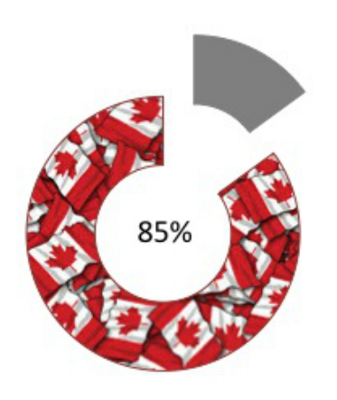
Figure 1. Physical inactivity burden in North America. 85% of Canadian adults and 97% of American adults fail to meet public health guidelines for physical activity.

including primary and secondary prevention of chronic and non-communicable diseases [4]. Physically inactive lifestyles are the fourth leading cause of death, and globally contribute to more than 3 million deaths per year [5]. In North America, the majority of adults in the United States and Canada are not meeting minimum public health recommendations for physical activity [6,7]. Engaging in unhealthy physical activity behaviors, such as a physically inactive lifestyle, has substantial negative consequences for public health including the economic burden for society [5] (see Figure 1).