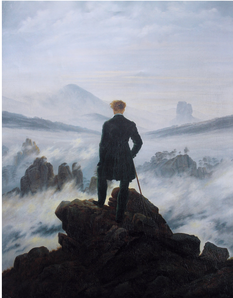
Figure 8: Caspar David Friedrich, Wanderer Above the Sea of Fog (1818). Kunsthalle Hamburg. Oil on canvas.

novels – the very mind of romantic liberalism, contemplating such things (Baucom 2005: 288). Turner’s Romanticism has much in common with that of German painter Caspar David Friedrich, whose famous Wanderer above the Sea of Fog (1818) illustrates the perspective of spectators before Turner’s Slavers : transcendent, above and somehow after a remote object that is either sublime, horrific, or cause for suffering, and wrapped in an idea of self impressed with its own perceived alienation.