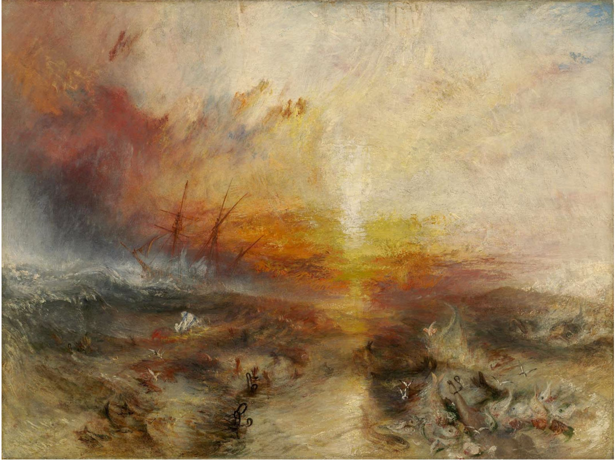
Figure 5: J.M.W. Turner, The Slave Ship (1840). Oil on Canvas. Museum of Fine Arts, Boston.

Turner's exhibition took place just down the street from the first World Anti-Slavery Convention in Exeter Hall. The (near) distance speaks volumes, for while the work's title clearly refers to the Zong , its more powerful commentators picked up on the work's more abstract features. Despite negative reviews – “a tortoise-shell cat having a fit in a platter of tomatoes,” Mark Twain complained (159) 146 – no description of the painting was more famous or powerful than that of John Ruskin who, in the first volume of his influential Modern Painters (1846), exclaimed upon the painting's “daring conception,” “absolutely