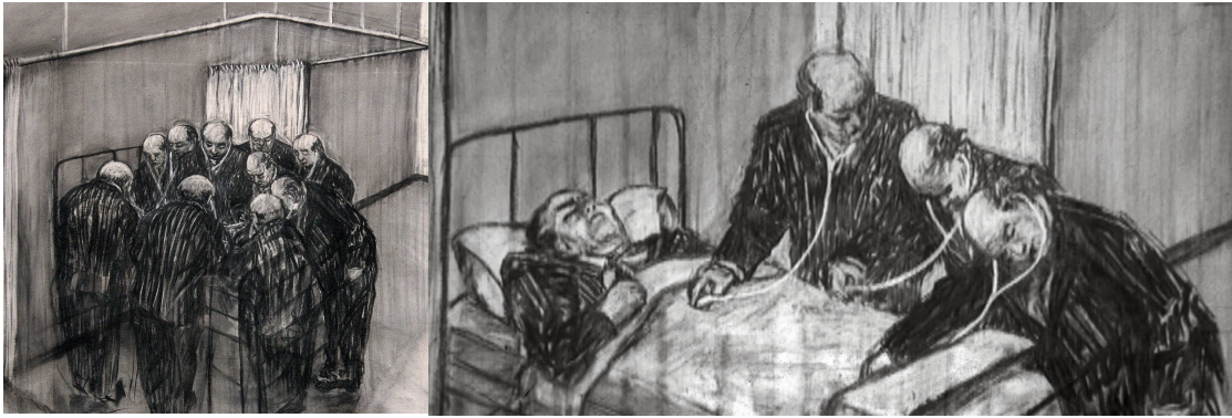
Figure(s) 4: Stills from William Kentridge, History of the Main Complaint (1996). Projection with sound.

despite seeing no other form of liberation looming but death” (1996: 227). The body politic and the skin of culture sickened; the language of poetry reflects social cancer. Like a mirror – or like the transforming charcoal animations of William Kentridge’s History of the Main Complaint (1996) – a poem reflects a series of apparent selves endlessly self-creating and then wiping themselves clean from the ink in which the complaint is uttered.