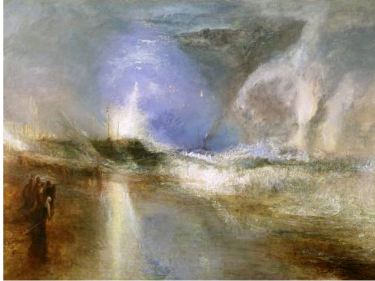
Figure 9: J.M.W. Turner, Rockets and Blue Light (1840). Oil on canvas. Sterling and Francine Clark Art Institute.

Turner's painting refracts the imagery of empire so that the historical embarrassment of slavery is aligned with the technologically outdated need for human labour. His aesthetic suggestion conveniently forgets the exploitation that financed imperial industries despite the Slavery Abolition Act of 1833, and retroactively casts slavery as a necessary act through the ineluctable and self-justifying movement of historical progress. No better chronicler of empire can be found than Joseph Conrad's Marlow: "What redeems it [empire] is the idea only [...] not a sentimental pretense but an idea; and an unselfish belief in the idea – something you can set up, and bow down before, and offer a sacrifice to..." (31-32). Conrad's aesthetic symptomizes Turner's milieu.