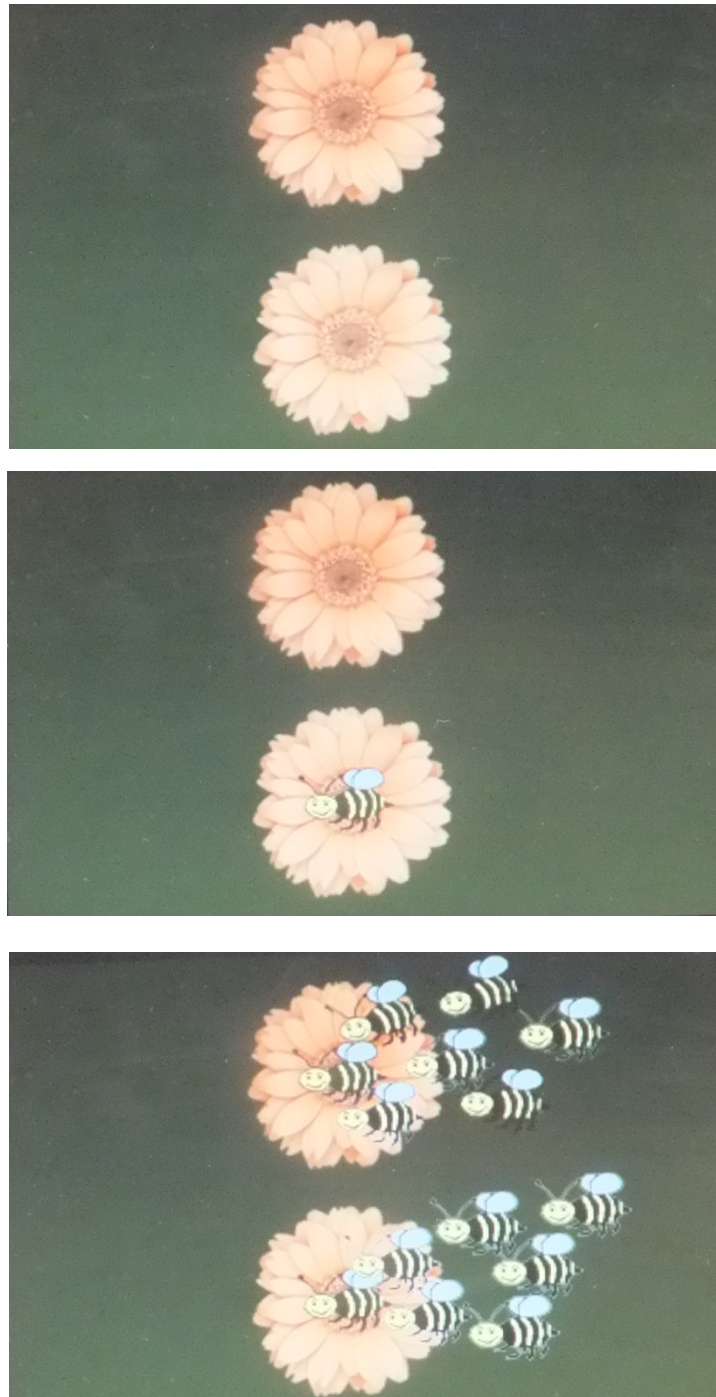
Figure 1. The Benny Bee Inspection Time Task (Williams, Turley, Nettelbeck, & Burns, 2008). Top panel: The flowers appear. Middle panel: Benny the Bee appears on one flower as the target stimulus. Bottom panel: Benny's friends appear to mask which flower Benny appeared on.