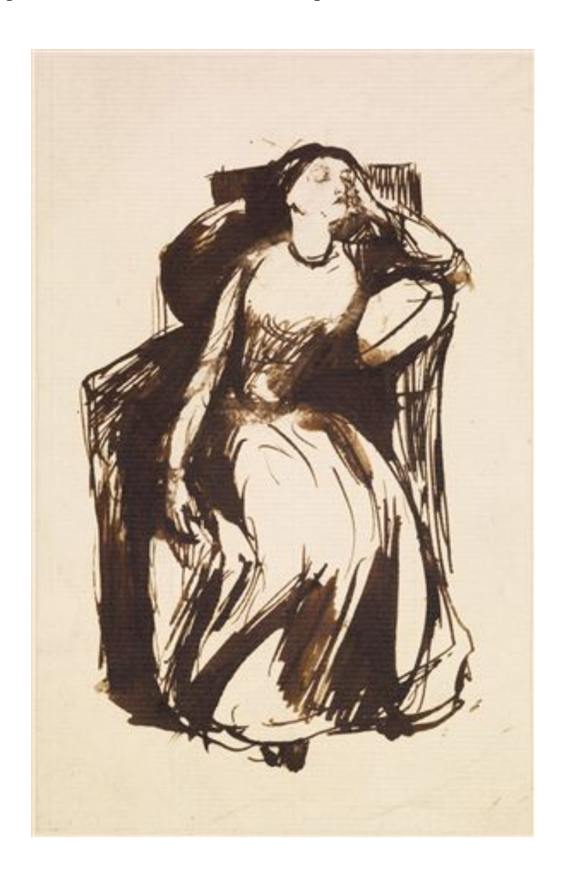
Fig. One: "Sketch of Lizzie Siddal," (1861?), Dante Gabriel Rossetti

Rossetti's drawings in the 1850s (Figure One), and in his series of paintings of bored women from the later 1850s (until his death in 1882), Siddal (and, later on, Jane Morris) embodies the problem of boredom as theme and process in Rossetti's work.