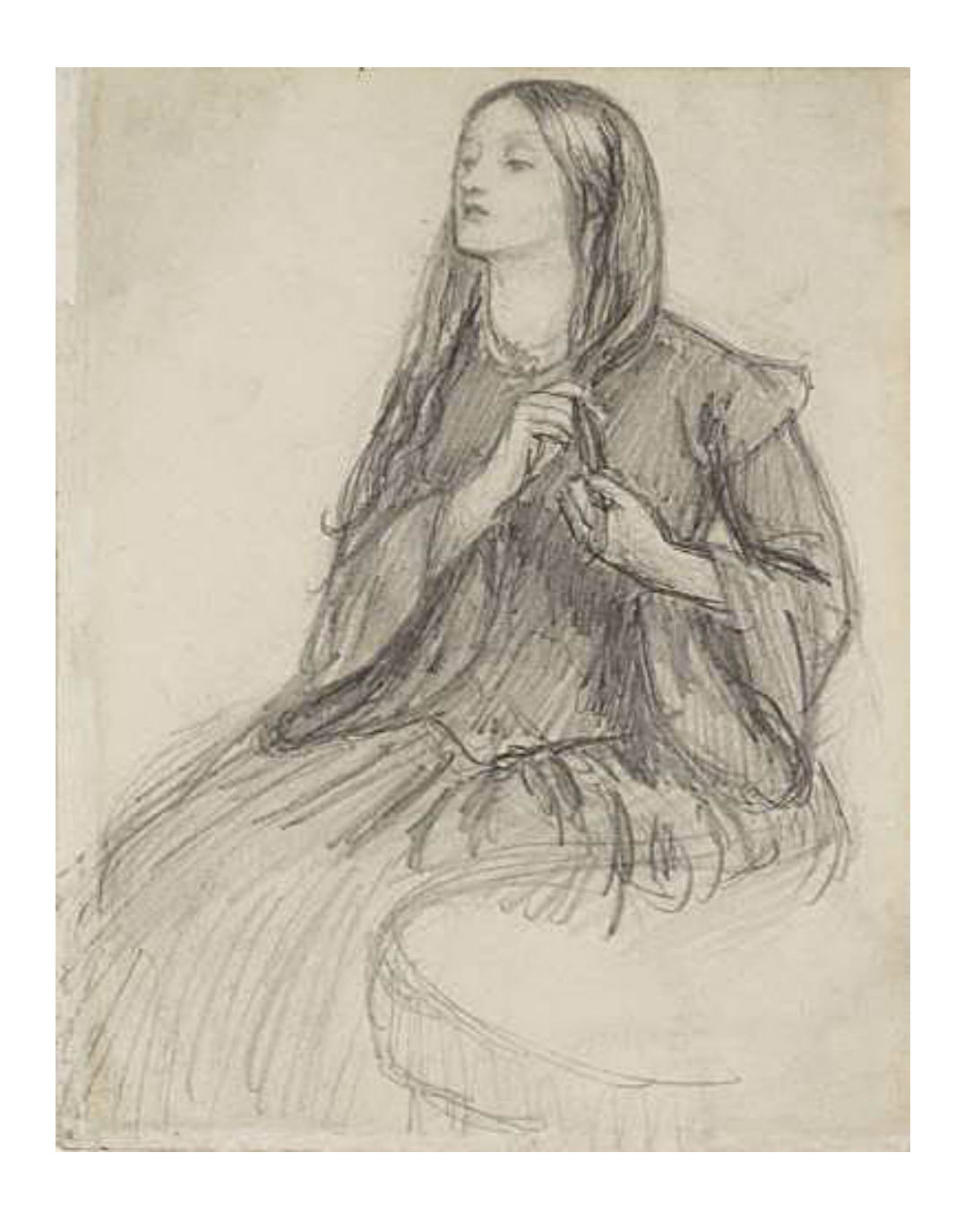
Fig. Two: "Elizabeth Siddal Plaiting Her Hair" (c. 1860), Dante Gabriel Rossetti