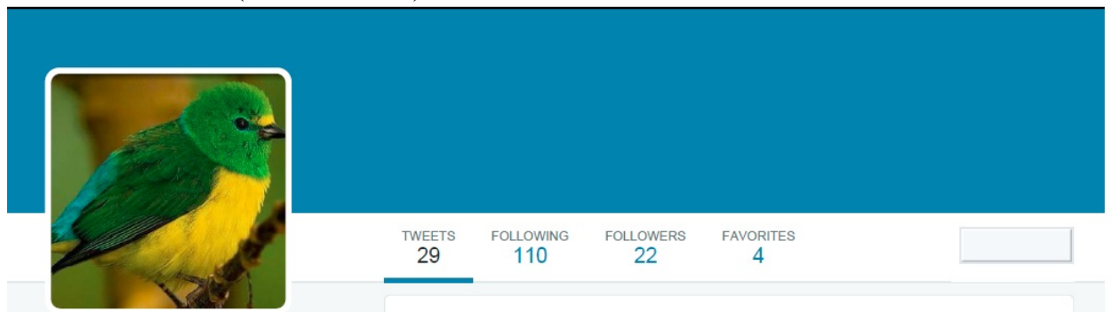
Pic 2. Account info (name removed)

The account was only known to be active for the period January 21 to February 13, 2015 (it disappeared sometime between the evening of February 11<sup>th</sup> and the morning of the 13<sup>th</sup>). During that time we were able to collect only 37 tweets and retweets. Those we collected suggested a serious interest in migrating from Canada to Syria to join the Islamic State.