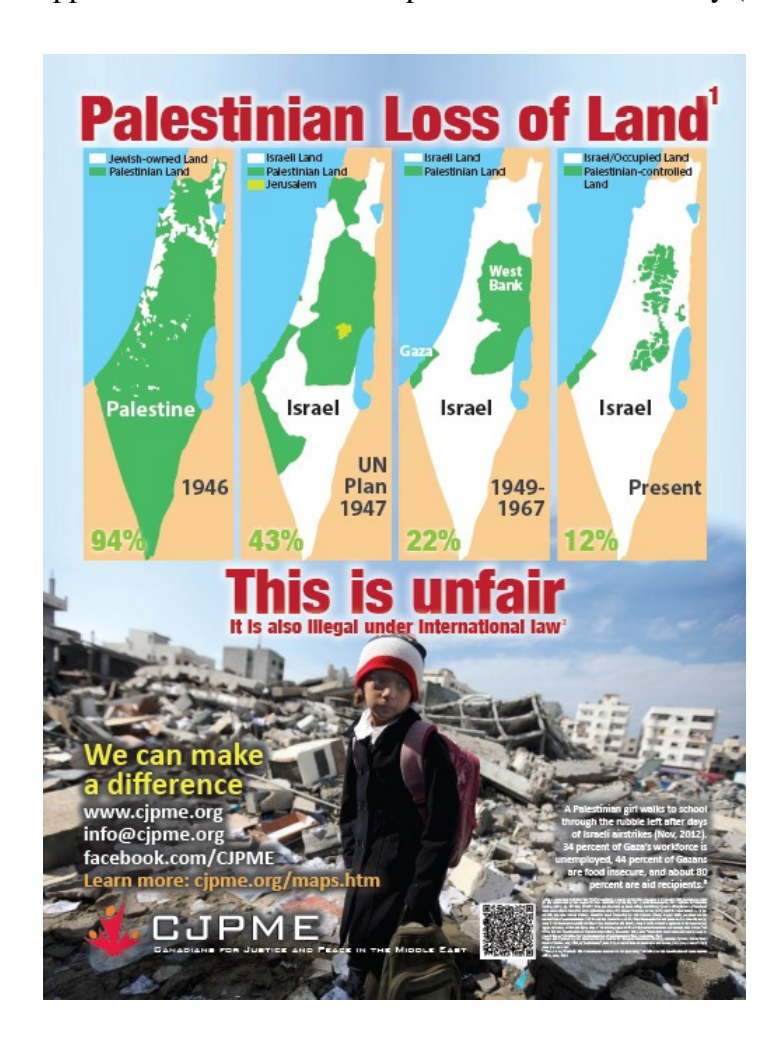
Figure 1: Poster template submitted by CJPME to the Toronto Transit Commission

that they didn't accept that the loss of land was "unfair or illegal", and the ad could incite anti-Jewish violence. TTC spokesperson Brad Ross told the Toronto Star that "making that statement may cause some ... to then target Israelis and/or Jewish people. Some may view it as discriminatory, [and] could advocate for violence or hatred against Israel or the Jewish people." He also added a particularly galling and uninformed statement - given the numerous UN resolutions and International Court of Justice decision on the illegality of Israel's occupation - that "there is no finding in our legal opinion of illegality around loss of land under international law ... no court, no tribunal has ruled on loss of land being illegal" (Kalinowski 2013). The language largely reflected that of the B'nai Brith which congratulated the TTC for its decision (B'nai Brith 2013). CJPME says it plans to appeal the decision to the Supreme Court if necessary (Raza 2013).