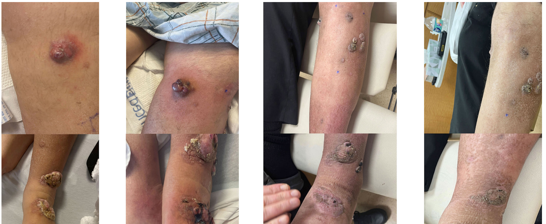
Figure 1. Serial images of patient's extramedullary fungating skin lesions.

To our knowledge only one other case of TFR has been reported with talquetamab though more cases in the setting of anti-BCMA directed therapies have been reported. 8,9 None of these cases involved dermatological progression, and the other case of talquetamab induced TFR was noted on positron emission tomography scan only. Furthermore, the flare in tumor markers corresponding with our patient's