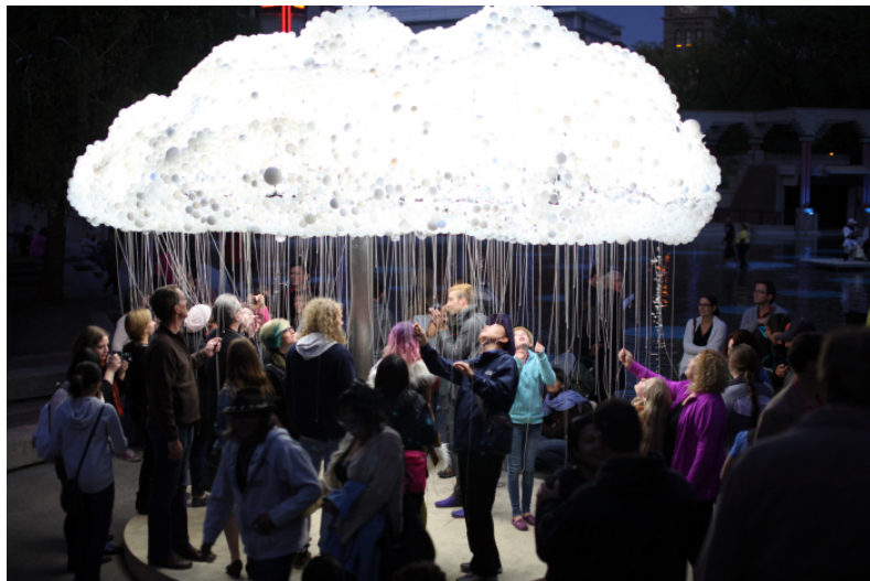
Figure 12: Caitlind r.c. Brown and Wayne Garrett, CLOUD , 2012. Nuit Blanche Calgary. Photographer Unknown. http://incandescentcloud.wordpress.com/2012/09/27/sleepless-night-nuit-blanche-calgary/# (accessed June 1, 2014).