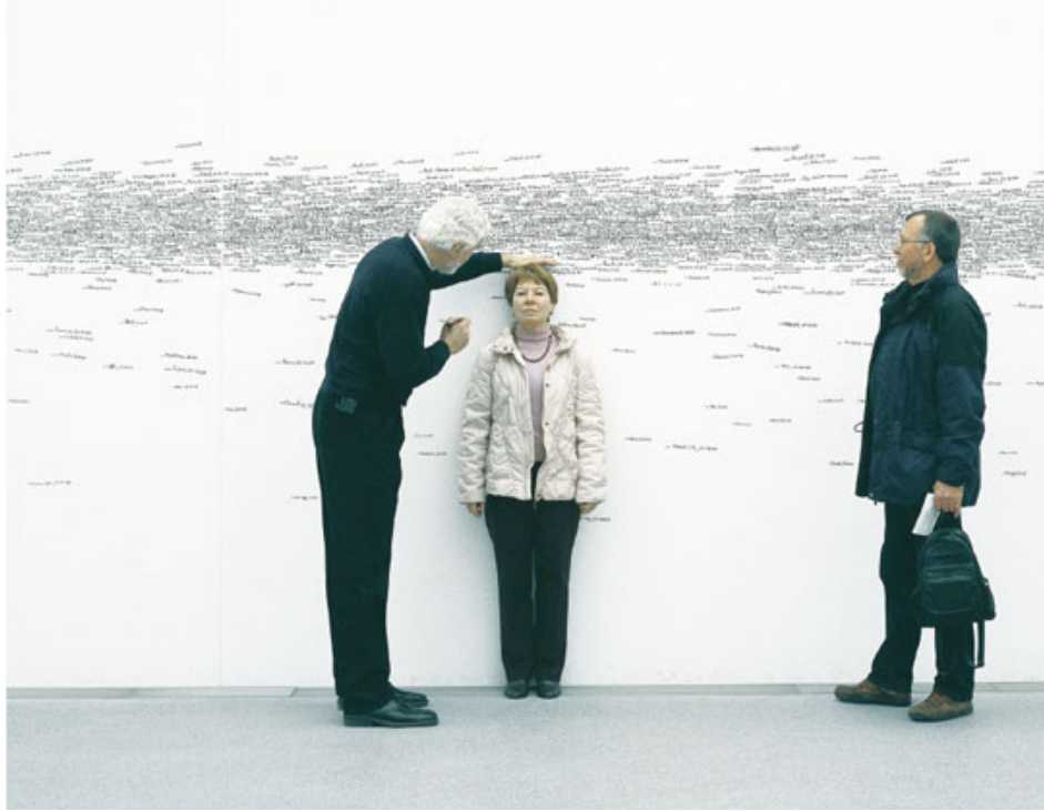
Figure 1: Roman Ondák, Measuring the Universe , 2007. View of installation at Pinakothek der Moderne, Munich, Germany. Photograph by Ernst Jank. http://www.flashartonline.com/interno.php?pagina=articolo_det&id_art=439&det=ok&title=ROMAN-ONDAK (accessed June 1, 2014).