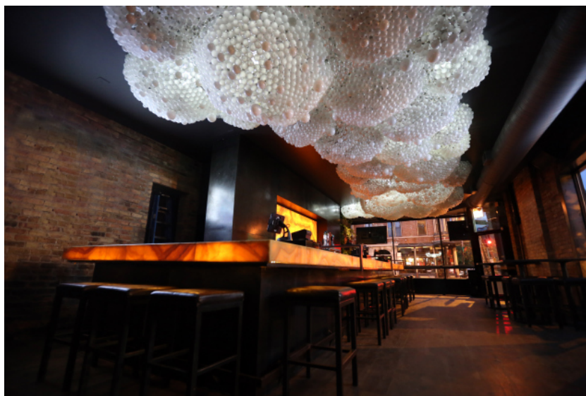
Figure 16: Caitlind r.c. Brown and Wayne Garrett, CLOUD CEILING , 2013.

Progress Bar Chicago, USA.