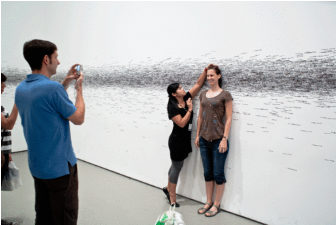
Figure 4: Roman Ondák, Measuring the Universe , 2007. The Museum of Modern Art, New York. Photographer Unknown.

work in the virtual social sphere, which can be considered an additional indicator of a successfully engaging interactive installation.