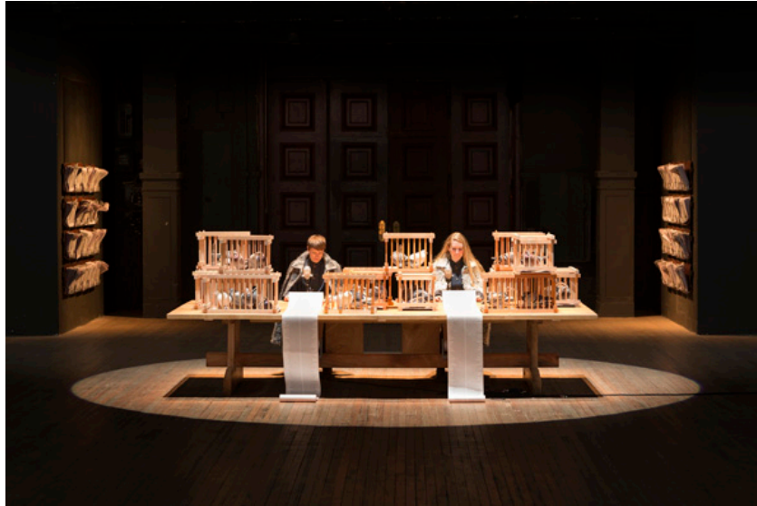
Figure 7: Ann Hamilton, the event of a thread, 2012-2013. Park Avenue Armory, New York. http://www.armoryonpark.org/photo_gallery/slideshow/ann_hamilton (accessed June 1, 2014).