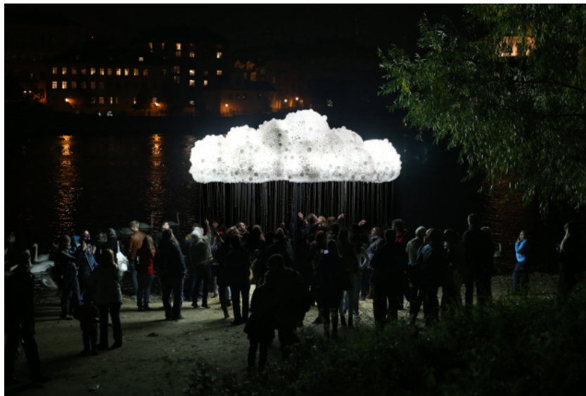
Figure 15: Caitlind r.c. Brown and Wayne Garrett, CLOUD , 2012. Signal Festival, Prague. Photographer Unknown. http://incandescentcloud.com/2013/10/22/cloud-at-signal-festival/ (accessed June 1, 2014).

Singapore (Figure 15). 201 In addition, Brown and Garrett were commissioned to design a new version of CLOUD for permanent installation in a Chicago Bar (Figure 16). Titled CLOUD CEILING (2013), this third incarnation of CLOUD uses motion sensors instead of pull cords to turn the light bulbs on and off, allowing the work to respond to movement and human activity in the bar beneath it. CLOUD 's ability to build relationships with its public audiences means it easily translates to each of its various exhibition settings in very different areas of the world. Its successful exhibition in such a variety of locations is a testament to the work's relevance and relatability. Its reference to weather and the natural world is something people of all cultures and backgrounds understand and can identify with, while its use of light bulbs is also prevalent in most areas of the world. However, the most integral and perhaps relatable aspect of the installation is its social nature.