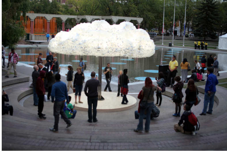
Figure 13: Caitlind r.c. Brown and Wayne Garrett, CLOUD , 2012. Nuit Blanche Calgary. Photographer Unknown.

http://incandescentcloud.com/2012/09/27/sleepless-night-nuit-blanche-calgary/#jp-carousel-880 (accessed June 1, 2014).