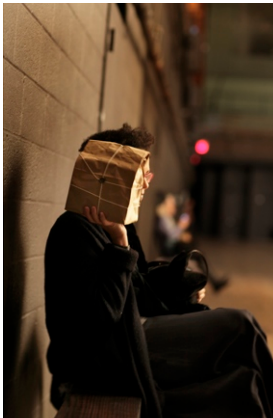
Figure 10: Ann Hamilton, the event of a thread, 2012-2013. Park Avenue Armory, New York.

http://www.annhamiltonstudio.com/projects/armory.html (accessed June 1, 2014).