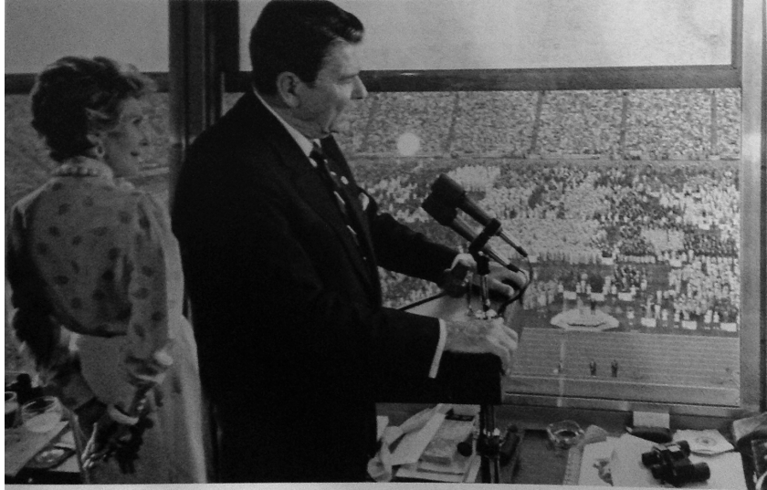
Figure 5.2 - President Ronald Reagan officially opening the 1984 Los Angeles Olympic Summer Games with wife Nancy at his side. From the Official Report of the XXIIIth Olympiad.

Without the Soviet and East German athletes in attendance at the Olympics, American athletes won an enormous number of medals – just as the Soviets did when American athletes were not competing in Moscow four years earlier. The Americans especially dominated the swimming competitions. The men’s team won nine of the fifteen gold medals while the women won eleven of the fourteen. In total, the United States won a combined 174 medals, 83 of them being gold.