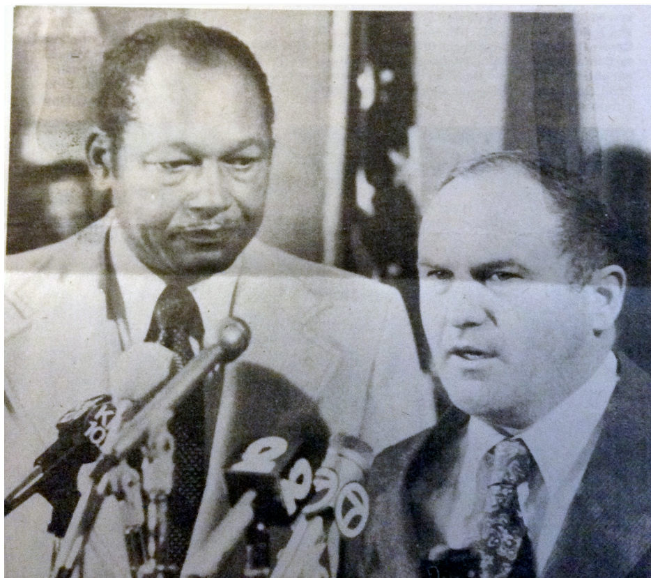
Figure 2.1 John Argue explains to the media that the city may withdraw its bid for the 1984 Olympic Games. Los Angeles Mayor Tom Bradley looks on. From the Centre Daily Times , 19 July 1978.

As early as 1 June, Councilman Marvin Braude was arguing that it was time to “pull the plug” on Los Angeles’ Olympic bid and formally withdraw its offer to the IOC. 96 Even former Olympic athletes were writing off the Los Angeles bid. Dwight Stones, the former world-record holder in the high jump, insisted “if they [SCCOG] think they can hold the Olympics in Los Angeles without it costing the taxpayers, they’re crazy.” 97 The public – and, more importantly, the Los Angeles City Council – agreed