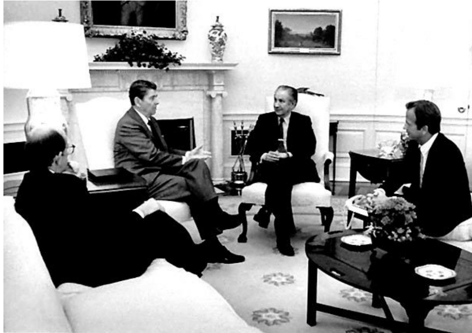
Figure 5.1 - President Reagan meets with IOC President Samaranch. Peter Ueberroth sits to the left of Samaranch. Deputy Chief of Staff Michael Deaver is to Reagan's right. From the Los Angeles Times , 8 May 1984.

The letter was clearly a formality at this point. Despite Reagan accommodating each and every one of their requests, the Soviets decided not to attend the Olympics largely based on the issues of security and safety. Years later, Vitaly Smirnov, one of the two Soviet members of the IOC, reminisced: