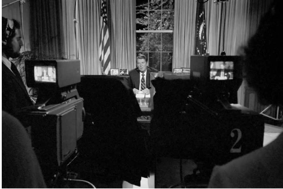
Figure 3.1 - Reagan delivering his speech regarding KAL 007 to the nation.

Privately, the President was “deeply disturbed that the Soviets could make such an error.” 93 Reagan concluded that the shooting down of KAL 007 illustrated how dangerously close the world was to the nuclear precipice. The Commander-in-Chief questioned if such “mistakes could be made by a fighter pilot, what about a similar miscalculation by the commander of a missile launch crew?” 94 The implications surrounding the KAL 007 tragedy resulted in Reagan questioning the validity and likelihood of an accidental nuclear war.