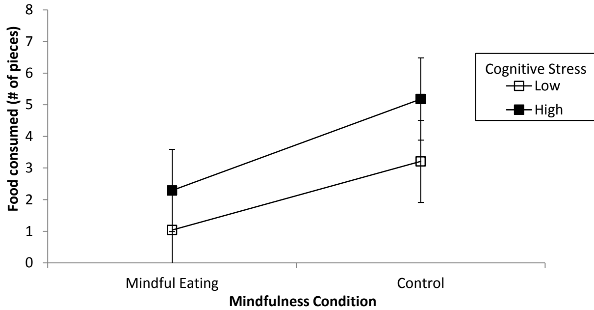
Figure 1. Mean number of pieces of food consumed for mindful eating and control conditions, under low and high cognitive stress conditions.

Error bars represent 95% confidence interval for the interaction.