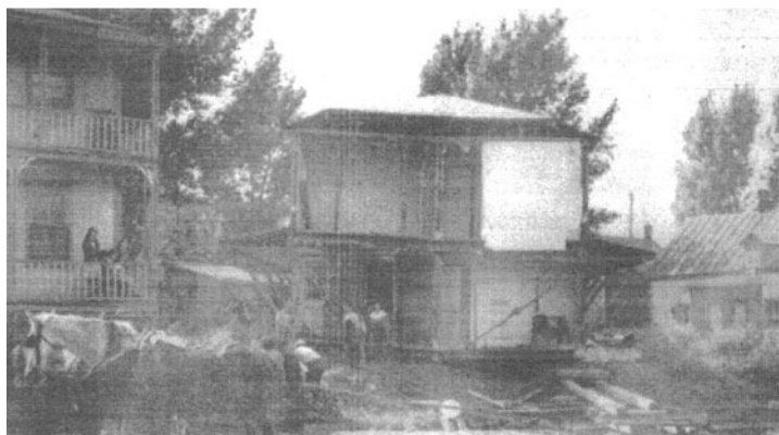
Moving homes in Asbestos, Quebec, circa 1940 312

horses from one location to another each time the Jeffrey Mine grew. In June 1942, town council annexed almost 3,000 feet of unused farmland in order to expand the