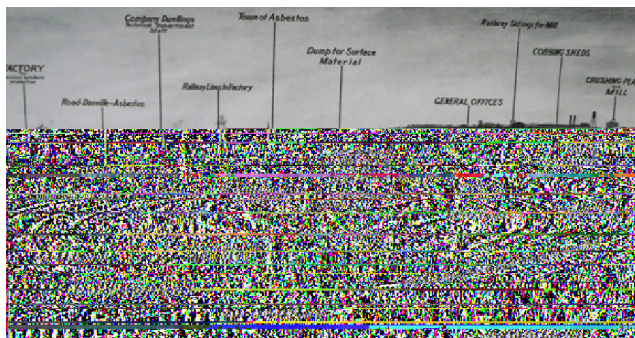
Mining and haulage arrangement of levels and approaches at the Jeffrey Mine, 1939 301

The expansion was viewed as another example of progress after the economic trials of the early 1930s, and in order to compensate for lost land, council purchased 7 unused lots from Joseph Isabelle in January 1939. 298 The town needed more liveable land to accommodate a growing workforce and a shrinking community space caused by the expanding pit. The following spring, council purchased 14 additional undeveloped lots belonging to Eugenie Bolduc. 299 The town was learning to balance mine and community land use. These purchases were well planned, as 1939 saw great development in the land of the community, and the Jeffrey Mine was declared to be the largest asbestos mine in the world. 300 By making the industrialization of the land a priority, the community