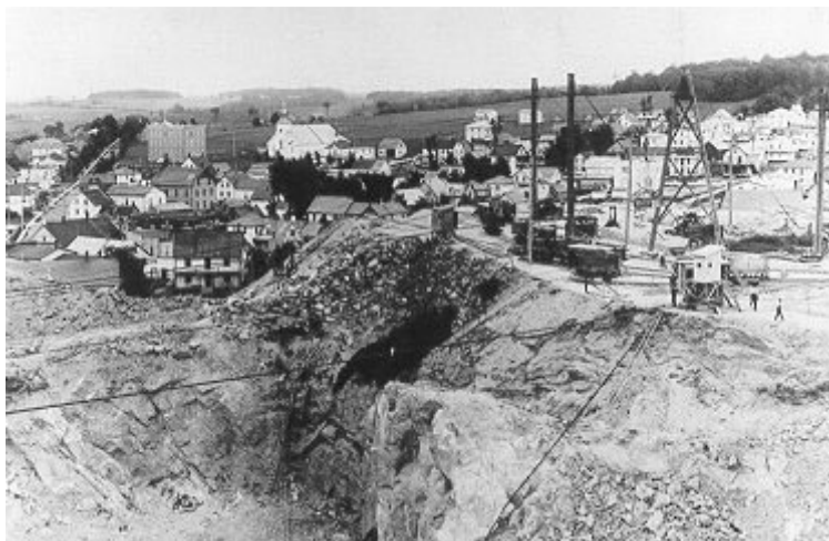
The Jeffrey Mine and the town of Asbestos, Quebec, 1909 208

Impressive revenue and reputation contributed to changes in government policy at the beginning of the 20 th century. Previously, Quebec had made money off its natural resources by selling the rights to them to private companies, but this changed by 1910, the year Henri Bourassa founded his nationalist newspaper, Le Devoir , and rallied against non-French Canadian ownership of Quebec's natural resource industries. 209 Bourassa and his followers formed a powerful group and the province slowly began to lease rather than sell rights to the land. The government's change in policy came too late to capitalize fully on the Jeffrey Mine and it missed out on a share of the £500,000 profit the British Asbestos and Asbestic Co. gained for the H.W. Johns-Manville Company in 1910. 210 Bourassa believed that the development of resource industries in Quebec was the key to national and economic power, which were the "weapons of this century." 211 In the case of asbestos, Quebec had surrendered its "weapons" to the United States: by 1907, the industry was largely owned by Americans.