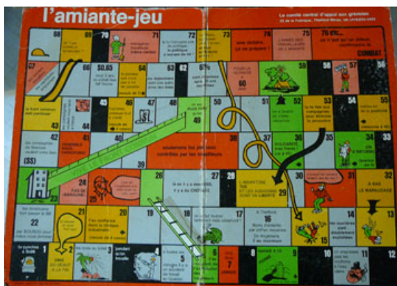
“L’amiante-jeu,” dealing with the issues of the 1949 strike 688

wage. At the bottom, were the negative aspects of the industry: company heads paying for tropical vacations with the money workers earned them, and deaths due to asbestosis. 687