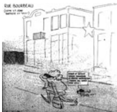
Editorial cartoon illustrating the streets of Asbestos, 1971 997

An indication of this communal acceptance of risk was seen on 13 July 1971, when the headline of the local paper read, “Poussière à Vendre, Rue Bourbeau,” and an editorial cartoon depicted a woman crossing the road covering her face against the blowing dust while her dog exclaimed, “If I had known that she wanted to cross the desert today, I wouldn’t have gone out with her!” 996 The air in Asbestos was thick with toxic dust, but while community complaints suggested that townspeople were frustrated with its presence, the spirit of the editorial cartoon was playful and accepting rather than angry and frightened: the people of Asbestos were not afraid of the dust.