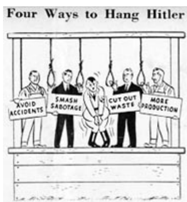
Editorial cartoon distributed to Jeffrey Mine workers, June 1942. 576

The war transformed Quebec industrial society and how workers organized, and further encouraged Jeffrey Mine workers. In the June 1942 issue of the Johns-Manville News Pictorial , an editorial cartoon explained that the “four ways to hang Hitler” were to avoid accidents, smash sabotage, eliminate waste and increase production. 575 By doing