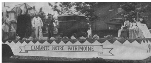
The float made by Jeffrey Mine workers, 1967 861

Rather than consider community needs and opinions, the journal stated that the future of Asbestos depended on further industrialization of the Jeffrey Mine, and trucks that could carry 100 tonnes of fibre from the bottom of the pit were soon introduced. Despite this industrialization, and despite the danger of huge rocks blasting through the community, the people of Asbestos managed to maintain their connection to the land. This connection was illustrated during the 1967 St-Jean Baptiste Day parade in Asbestos when the community cheered for a float with a sign that read, “Amiante: Notre Patrimoine.” 860 The float demonstrated that the people of Asbestos believed that the mineral, and therefore the land, was their cultural heritage. While JM looked at the land