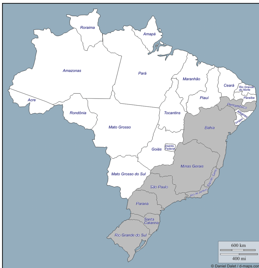
Figure 1 – States with Toll Facilities in Brazil 74

Currently Brazil has a total of 284 73 privately operated toll booths in 9 States out of 26 and the Federal District. It is among the countries with the most toll gates in the world – granted to 55 different private concessionaires operating highways.