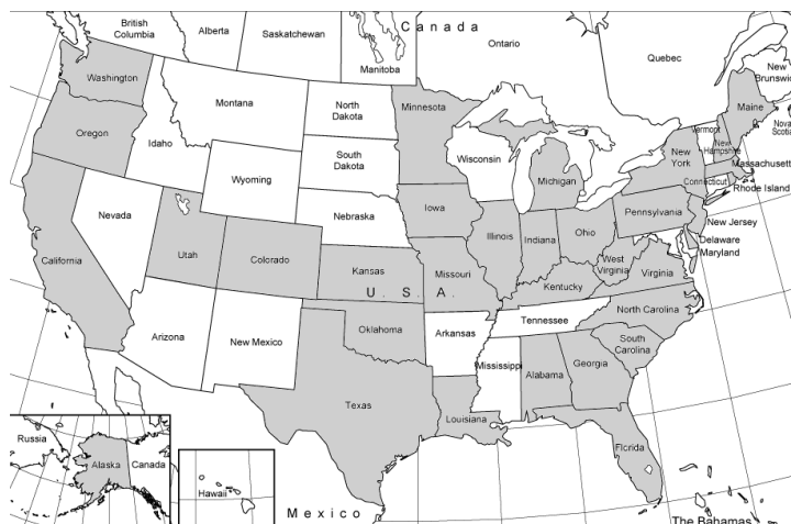
Figure 2 – US States 114 with Toll Facilities – in Gray.

Of all existing toll facilities in the US, just over 50% are found in 5 states (Texas, Florida, New York, New Jersey and Illinois) – precisely 50.43% 113 of the toll gates of the country.