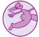
Med trommer og sang 83