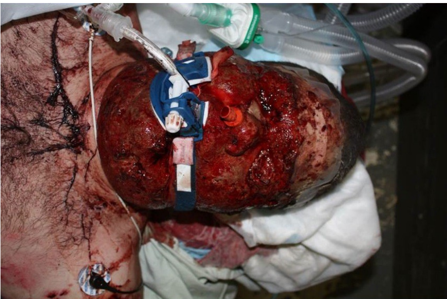
Figure 2: Coalition servicemen in same patrol not wearing eye protection

The British Maxillofacial Cadre has deployed to the multinational hospital in Kandahar for two separate blocks of one year each, with consecutive consultant surgeons deploying for