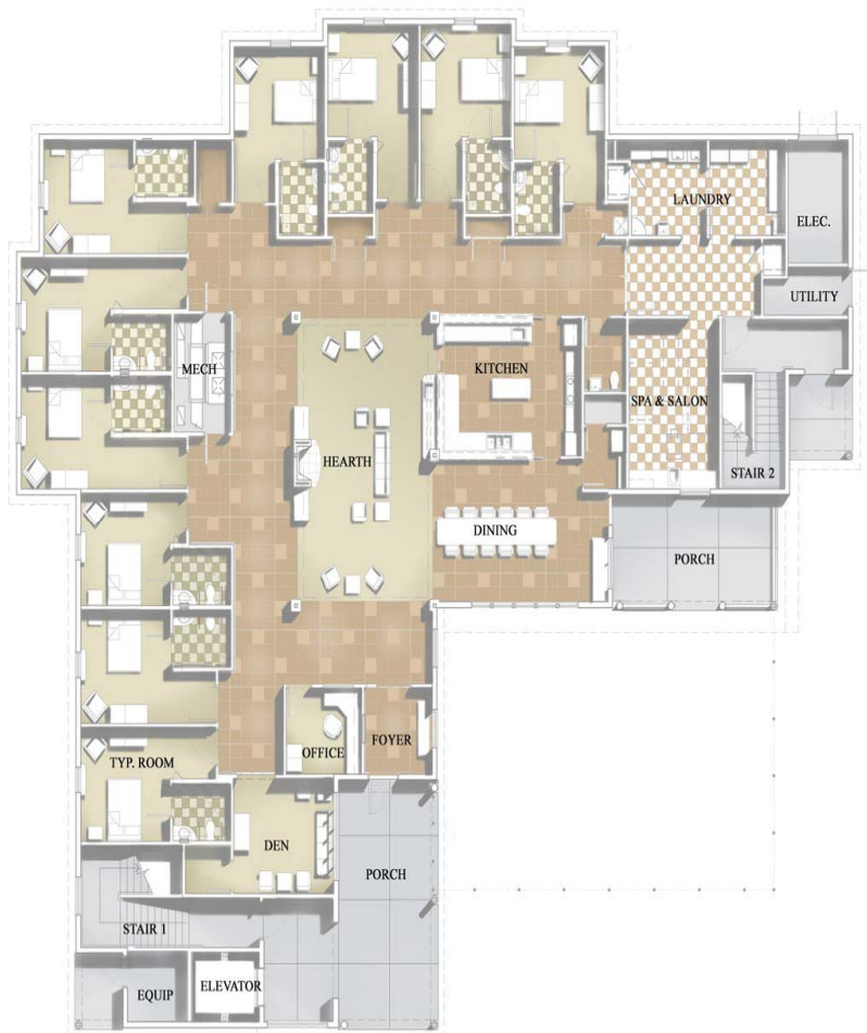
The Green House ®