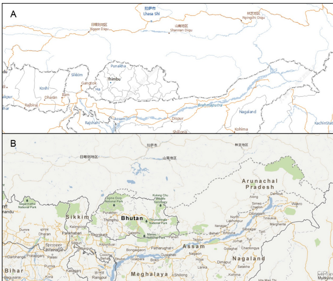
FIGURE 1 A comparison of Arunachal Pradesh as revealed in Tianditu and Google