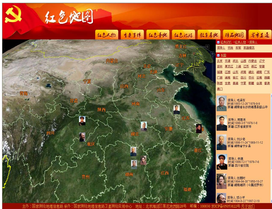
FIGURE 3 A map from the Red Map series

general idea of where in China communist leaders were born. Through the platform of web cartography, one can see the materialization of communist and nationalist ideologies, evoking China's unique socialist character.