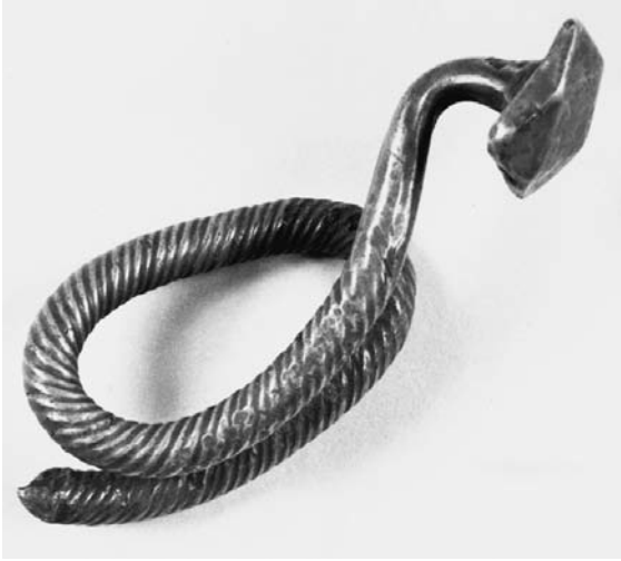
Fig. 4. Fragment of a 'Permian' spiral-ring from Ireland, unprovenanced.

from Ireland – that from the Dysart Island mixed hoard of coins and hack-silver (M. Ryan et al 1984, 356-361). Its results indicated that this silver was not won from any known ore source in Ireland and, in addition, that the silver used to produce the Dysart ingots derived from broadly similar sources to those represented in the hoard from Cuerdale (Kruse 1992, 81) – a finding which is of some interest in that the Dysart and Cuerdale hoards share other important characteristics (Graham-Campbell 1987c, 112). In Britain, however, several analytical programmes have been carried out on a broad range of non-numismatic silver objects, including some from hoards with strong Hiberno-Scandinavian elements, and in some cases it has proved possible to demonstrate the probable use of Arabic and/or Anglo-Saxon silver as the source for particular objects. In the case of the Skaill, Orkney, hoard, for instance, the compositions of some of its ornaments and ingots were shown to be similar to those of Arabic coins (Kruse & Tate 1995, 74-75). On the other hand, the composition of some of the components of the hoard from Storr Rock, Skye, were closer to those