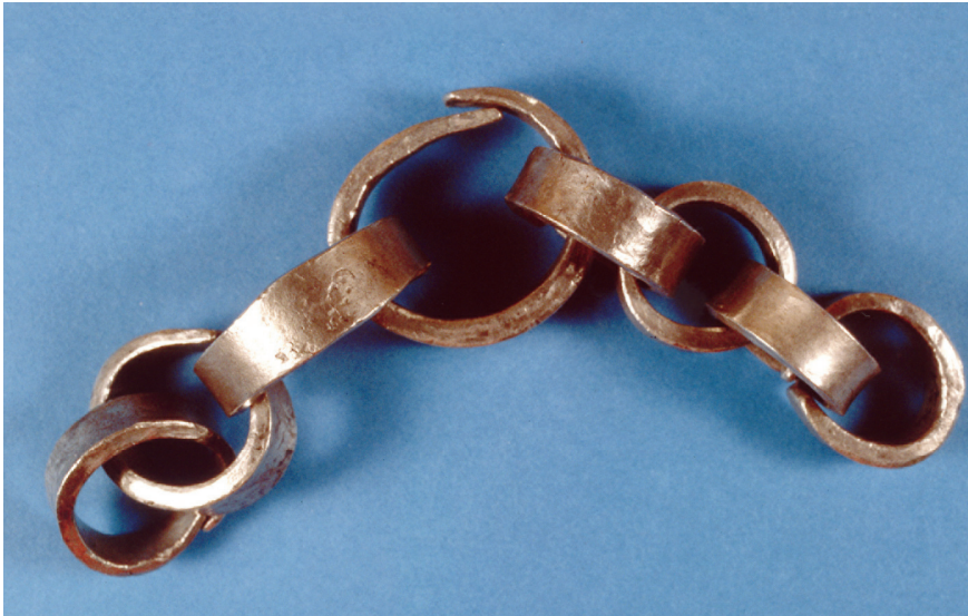
Fig. 1. 'Bullion-rings' from the 'Ireland no. 2' hoard.