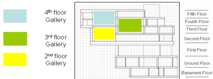
Figure 4-2 – North-South section through the Art Gallery Building depicting the split level galleries on the second/third/fourth floors

Art galleries - by their very nature - demand a highly controlled internal environment for the safe keeping of the art collections. Anne Fahey, in her reference book titled Collections Management (Fahey 1994), presents detailed text to develop standards for collections management. It highlights the significance of building type and condition as vital discriminating factors. It pointed to the fact that poor conditions endanger collections housed within. As a result, it was vital that any HVAC solution would have a minimal environmental impact yet guarantee the safe provision of the internal environment.