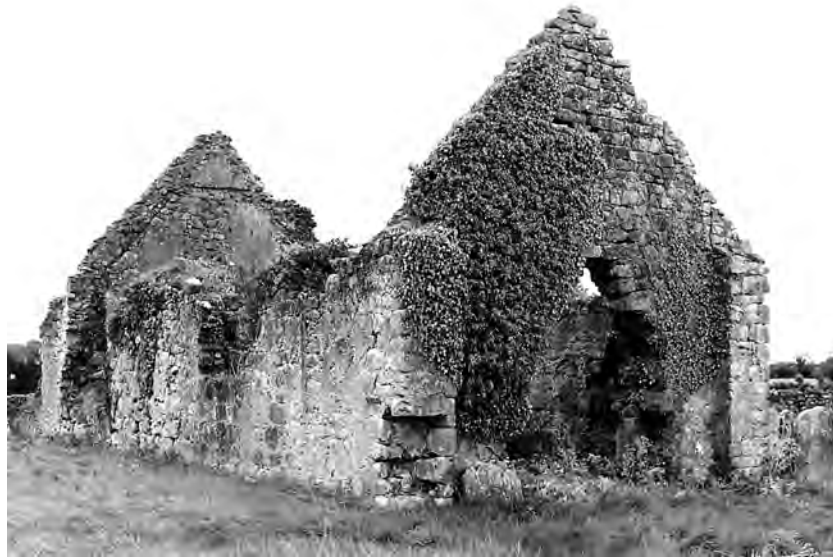
3 Pre-Romanesque church at Lynally, Co. Offaly: probably the church referred to in the Irish Life of Colmán Ela.

conceived, not as entirely new structures but rather as new versions of buildings erected centuries earlier, in much the same way that Chinese and Japanese temples are perceived as ancient despite the fact that they are periodically entirely rebuilt. 86