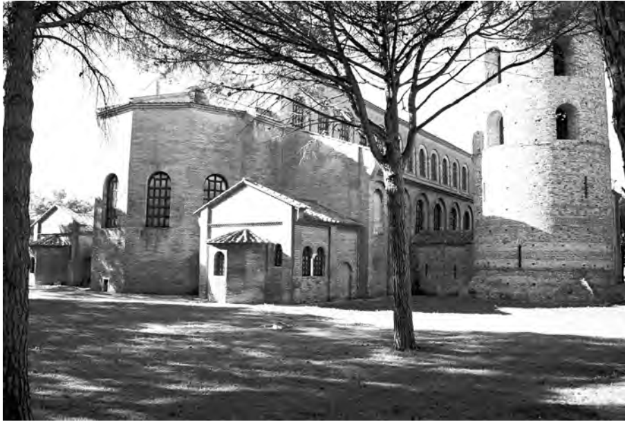
4 Eleventh-century freestanding belfry next to sixth-century basilica of St Appolinare in Classe just outside Ravenna (photo: author).

architectural innovation as ever more elaborate churches were built over these graves, along with increasingly sophisticated solutions to the problem of accessing their contents without disrupting the liturgy. 92 However, in Ireland the principal church was not a memoria built to provide a suitably impressive setting for the saint's primary relics; rather, it can itself be viewed as a secondary relic of the saint, having originally been built by him. In this regard they are like the crosiers and bells which were clearly seen as secondary relics though they were not made until long after the saints with which they were associated had died. 93 Peter Harbison has suggested that relics were kept outside in the cemetery because of the simplicity and modest size of Irish churches, 94 but it seems unlikely that such an important decision was determined by mundane space management issues. I have argued elsewhere that the Irish had clear symbolic and social motivations to maintain the link between relics and the cemetery, 95 and the evidence discussed here suggests they had equally compelling reasons to keep their congregational churches simple.