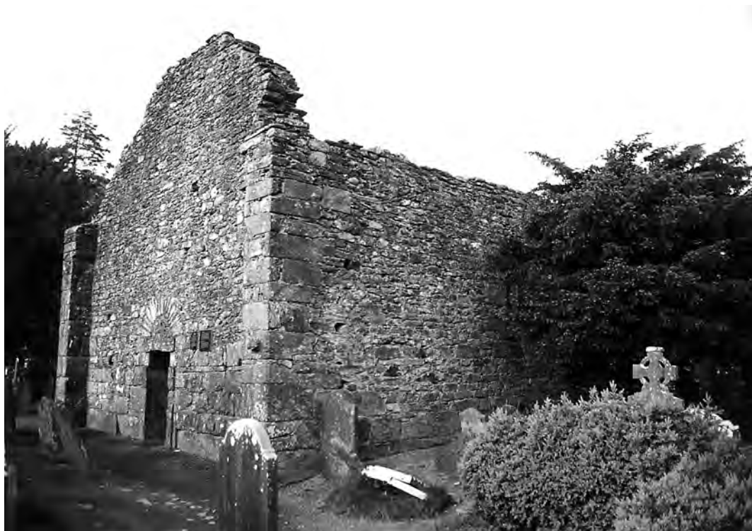
1 Glendalough cathedral. View of the pre-Romanesque nave from the southwest. Note the reuse of large blocks from an earlier church especially in the lower courses of the west wall. Note also the reused and enlarged doorway: its uppermost jamb stones were added when it was incorporated into the new church.

British churches when he was writing, but he noted that the earliest churches on the Continent were ‘like these, small and unadorned,’ and also noted that the first church at Glastonbury, ‘which was traditionally ascribed to the apostolic age’ was believed to be sixty feet long, like the church which Patrick’s hagiographers claimed he built at Donaghpatrick. 6 In fact, the most likely explanation for this metrological coincidence is that they are independent ‘citations’ of Solomon’s Temple, which was sixty cubits in length. 7 Nevertheless, while he lacked the hard evidence to substantiate his hunch, Petrie may well have been thinking along the right lines. In order to assess this we need, first of all, to consider whether Irish churches prior to the tenth century were also of this simple form. The admittedly limited sources we have give us little reason to doubt that they were.