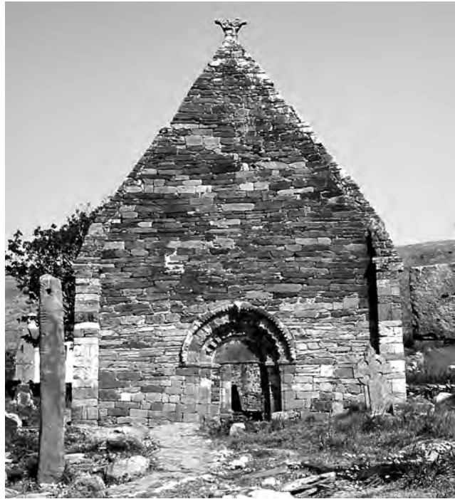
5 Kilmalkedar, Co. Kerry. Note the Romanesque doorway, the otherwise plain façade and the skeuomorphic antae, bargeboards and finial.

the Ravenna campanile were built as independent structures: namely in order to avoid interference with the fabric of the revered Early Christian basilicas (along with the centrally-planned church of St Vitale) for which most of them were built (fig. 4). 98 This unique group of basilicas had come to represent a glorious imperial and Christian past, and were therefore the most influential models for later churches in the Emilia Romagna region. 99 Even during the Romanesque period the influence of the Early Christian basilica was particularly strong there, and most new churches were single-tower, asymmetrical compositions