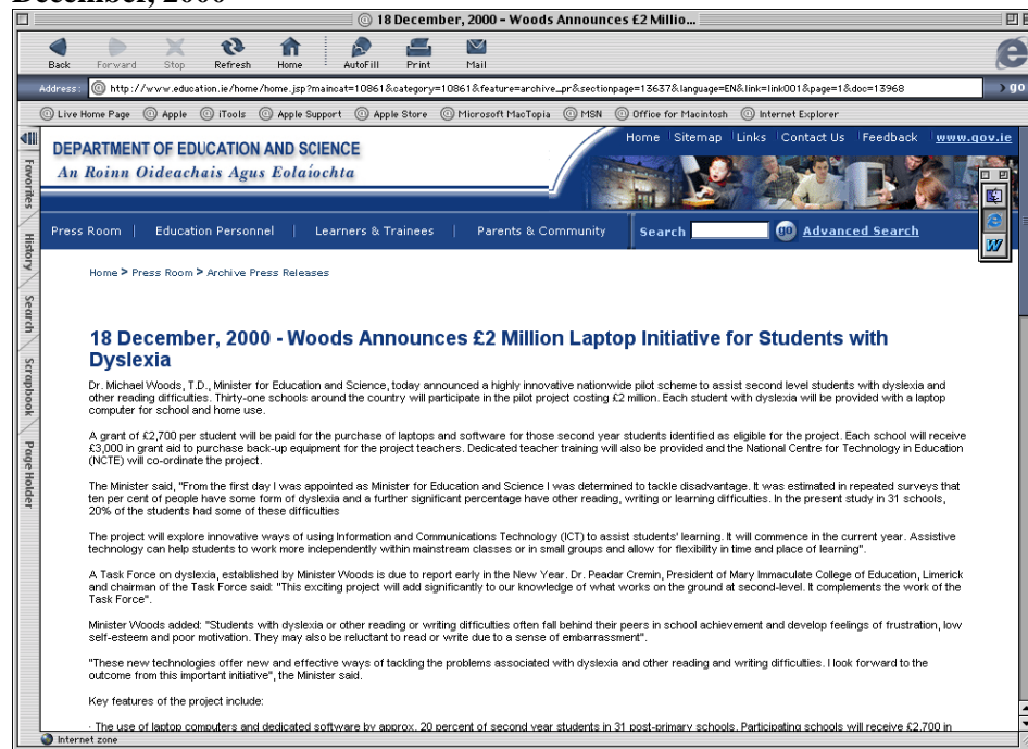
Figure 1 Department of Education and Science Laptops Initiative Press Release, 18 th December, 2000

Students with dyslexia or other reading or writing difficulties often fall behind their peers in school achievement and develop feelings of frustration, low self-esteem and poor motivation. They may also be reluctant to read and write due to a sense of embarrassment.