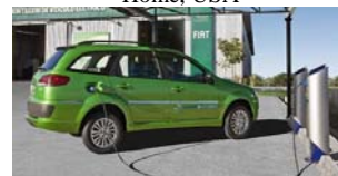
Private Garage, Italy