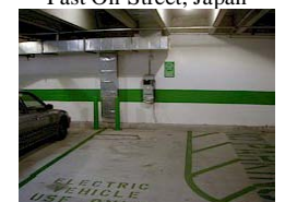
US Disabilities Compliance EV Parking Bay in a MSCP