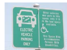
EV & Disabled Persons Parking Bay Sign