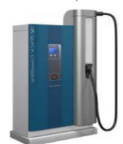
Fast On-Street, Japan