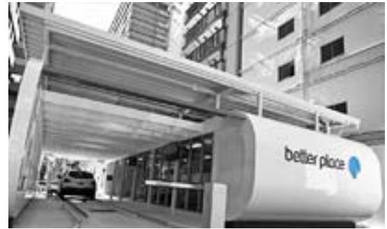
Figure 2. Battery Swap Drive-in Station

In addition to charging stations an Israeli company called Better Place proposes a battery swapping drive-in station [20]. Figure 2 shows a Better Place Drive-in Station.