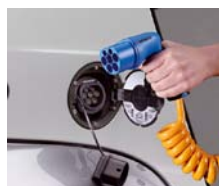
Mennekes Plug & Socket