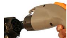
J1772 Plug & Socket