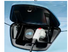
Nissan Plug & Socket