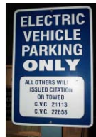
EV Parking Bay with City Ordinance Restrictions