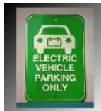
EV Parking BAY Sign at Costco, USA